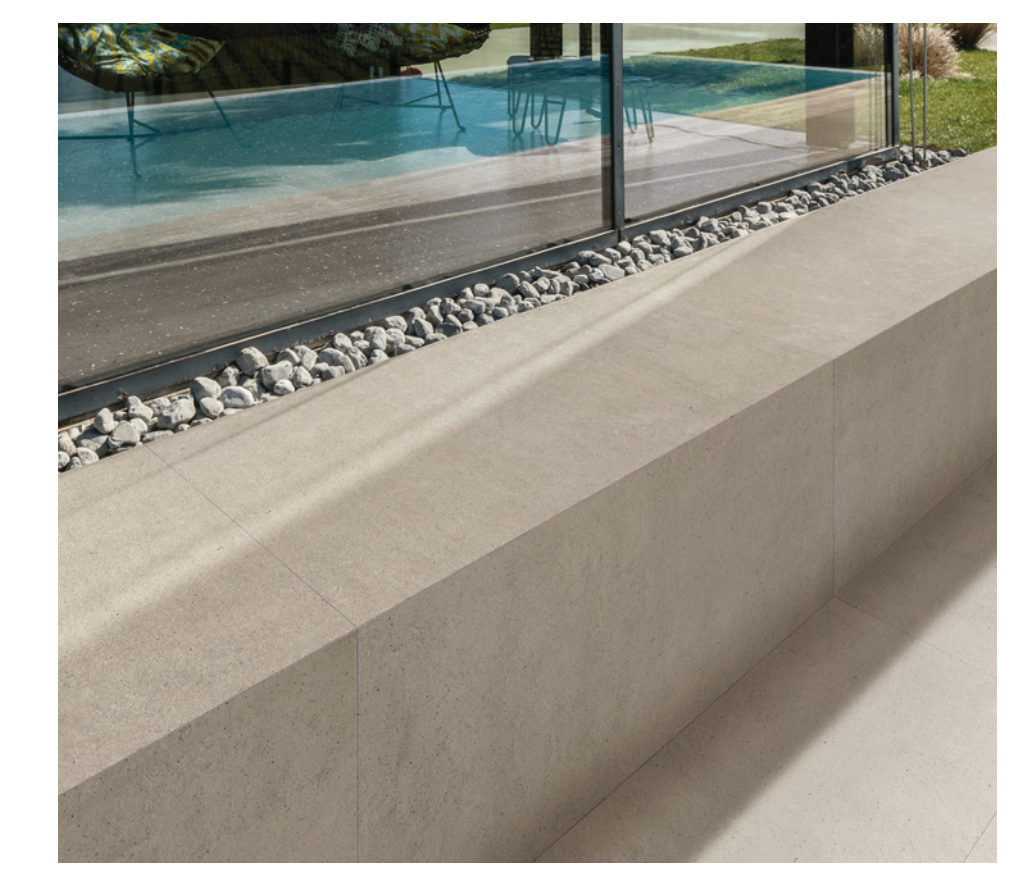
Outdoor Sides & Floor: DXF EGR 02 Grip Indoor Floor: Earthtech DFEFL 04 Flakes Comfort PTV