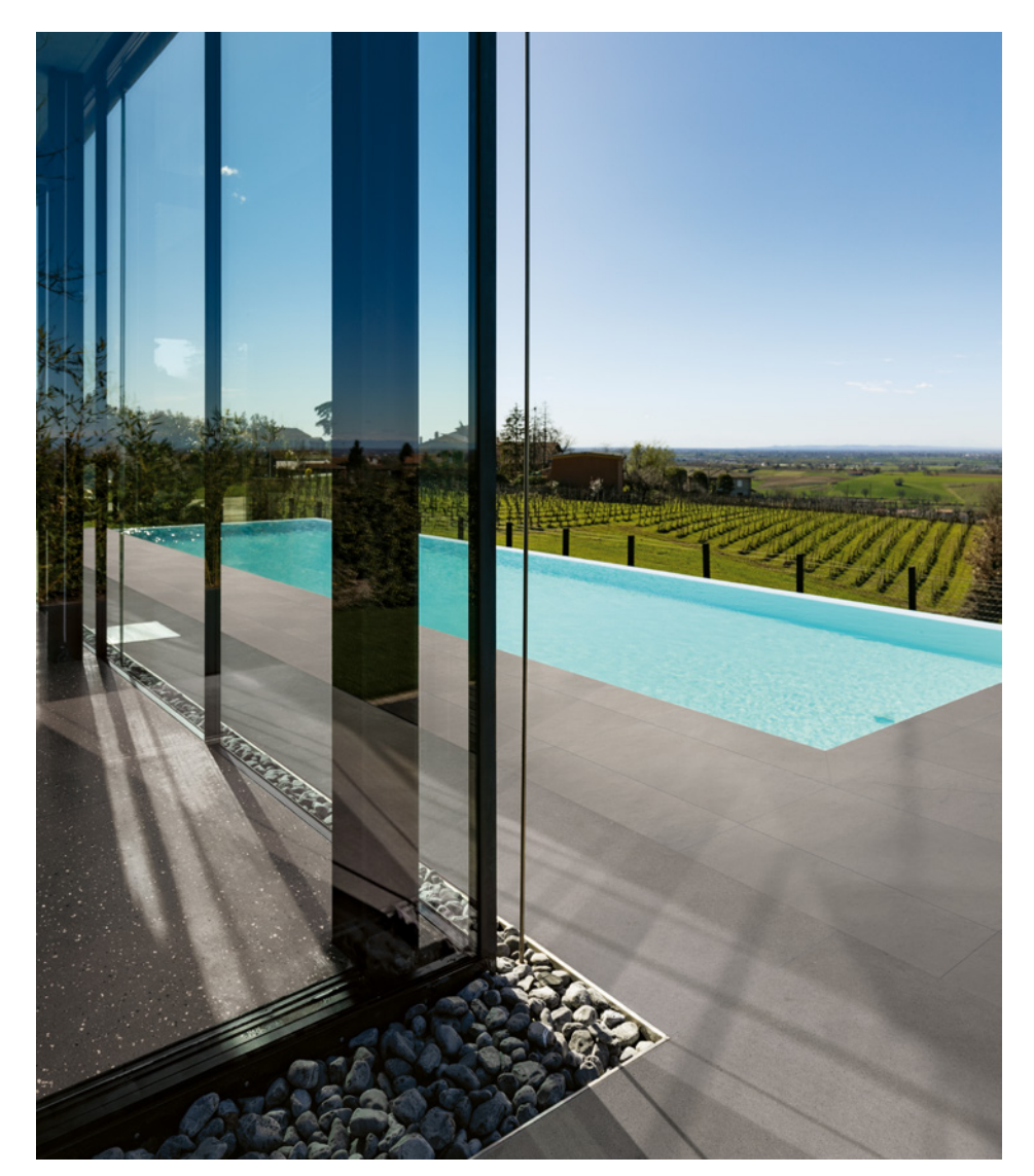
Outdoor Floor: DXF EGR 03 Grip Indoor Floor: Earthtech DFEFL 04 Flakes Comfort PTV