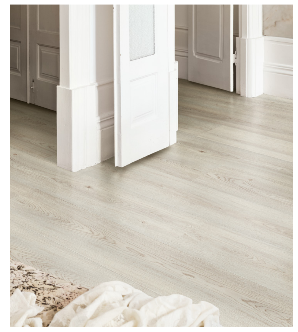
Floor: ELPE 365 Silk Matt