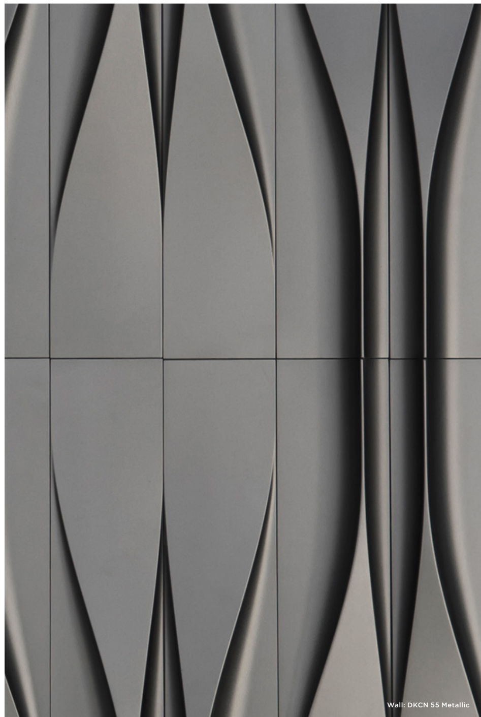
Wall: DKCN 55 Metallic