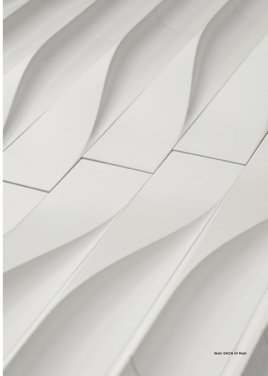
Wall: DKCN 01 Matt