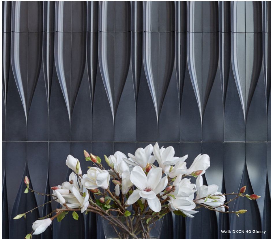
Wall: DKCN 40 Glossy

30 Colours / 3 Finishes / 3 Patterns / 1 Size