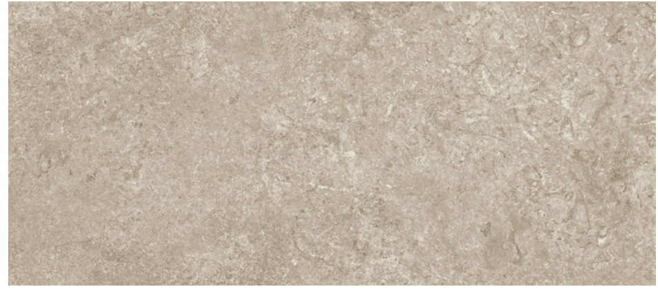
DXF DCSE 03