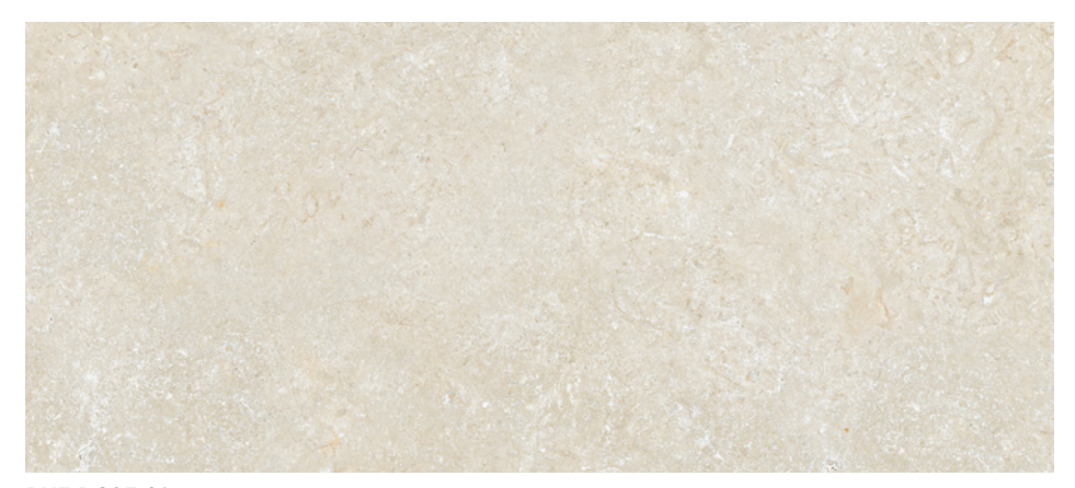
DXF DCSE 01