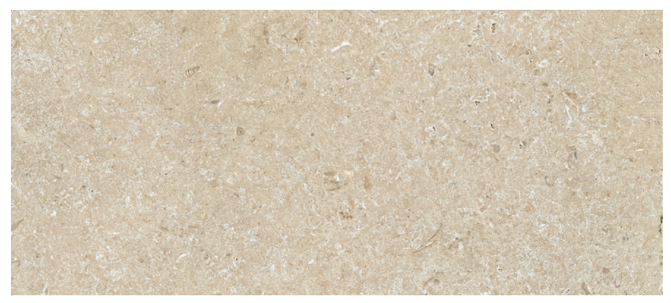
DXF DCSE 02