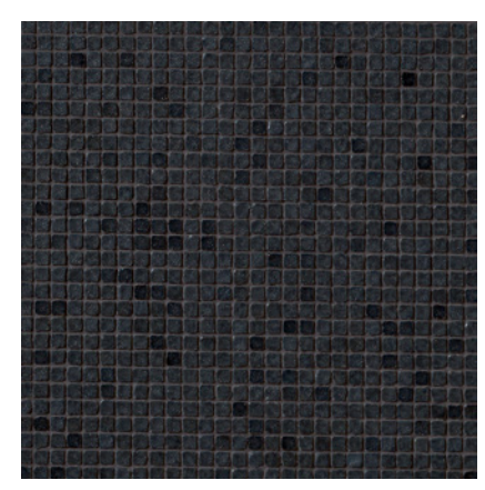
DTDM 05 Mosaic