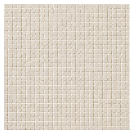
DTDM 01 Mosaic