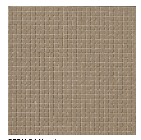
DTDM 04 Mosaic