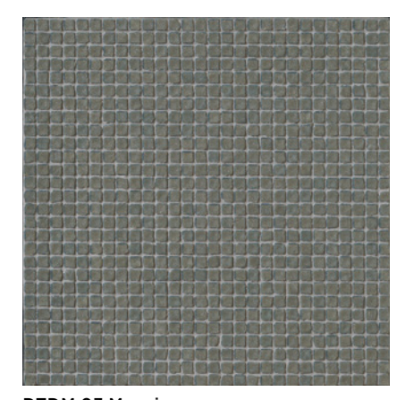
DTDM 03 Mosaic