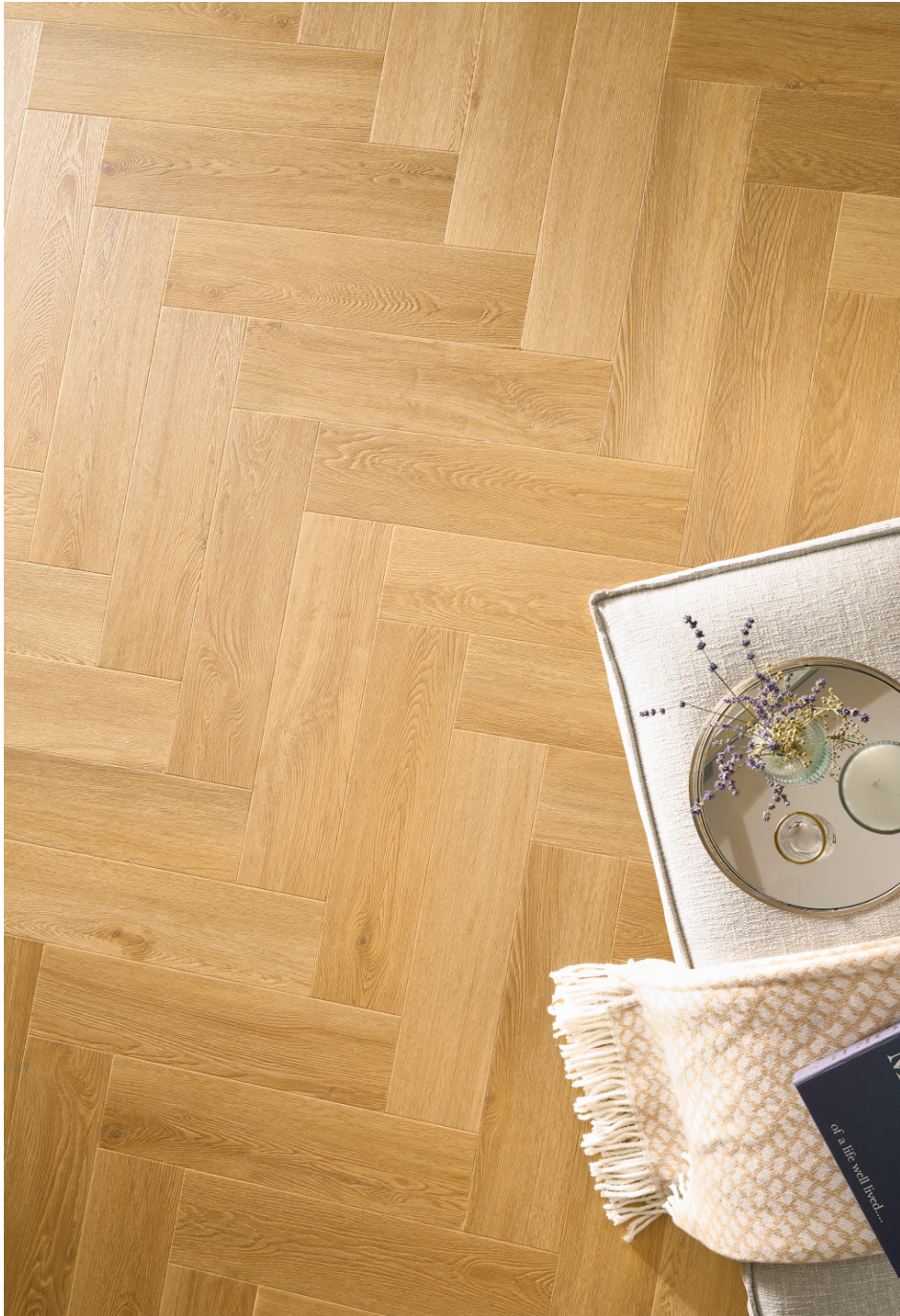
Floor: EVDC 5558 Herringbone Matt