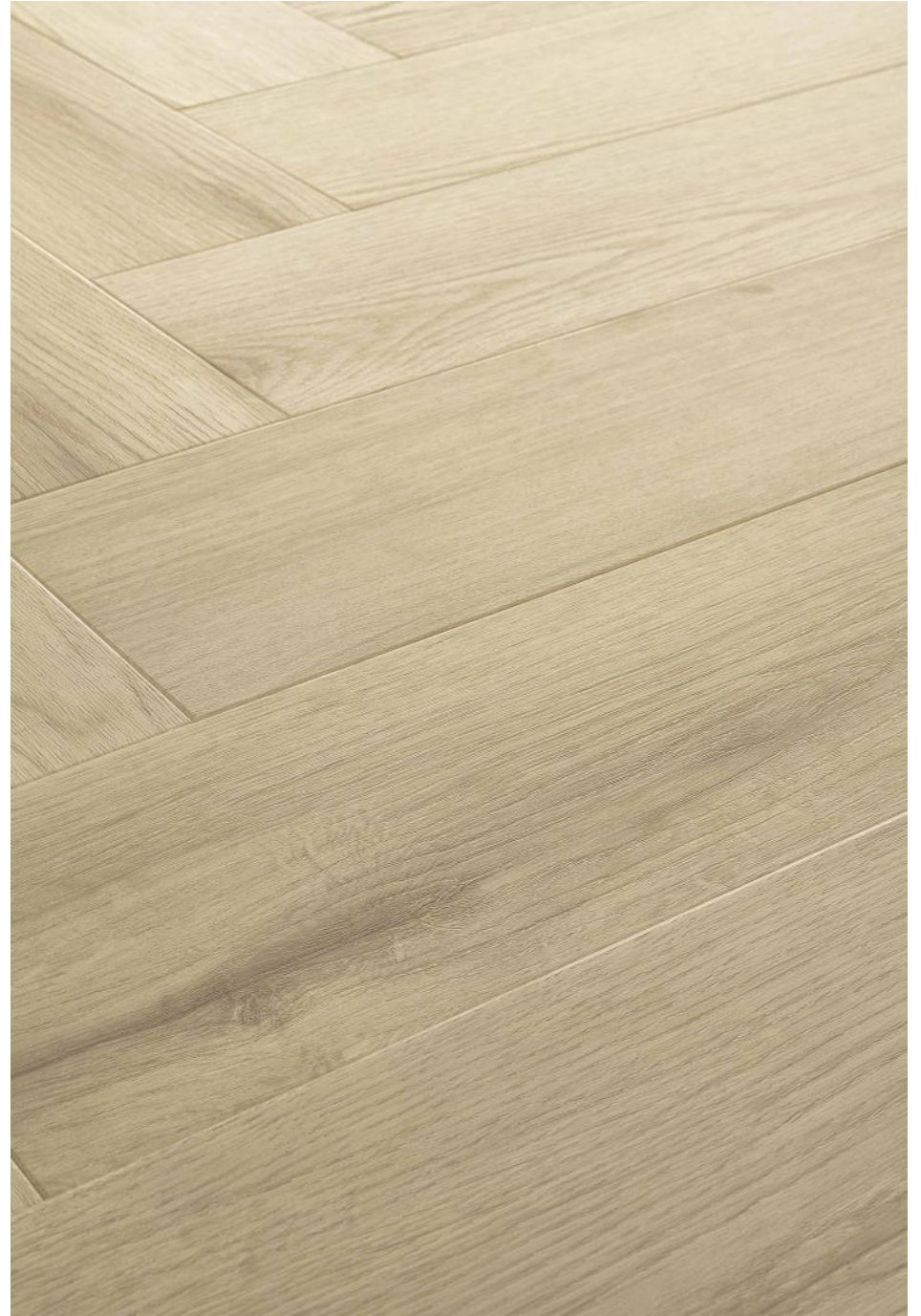
Floor: EVDC 5563 Herringbone Matt