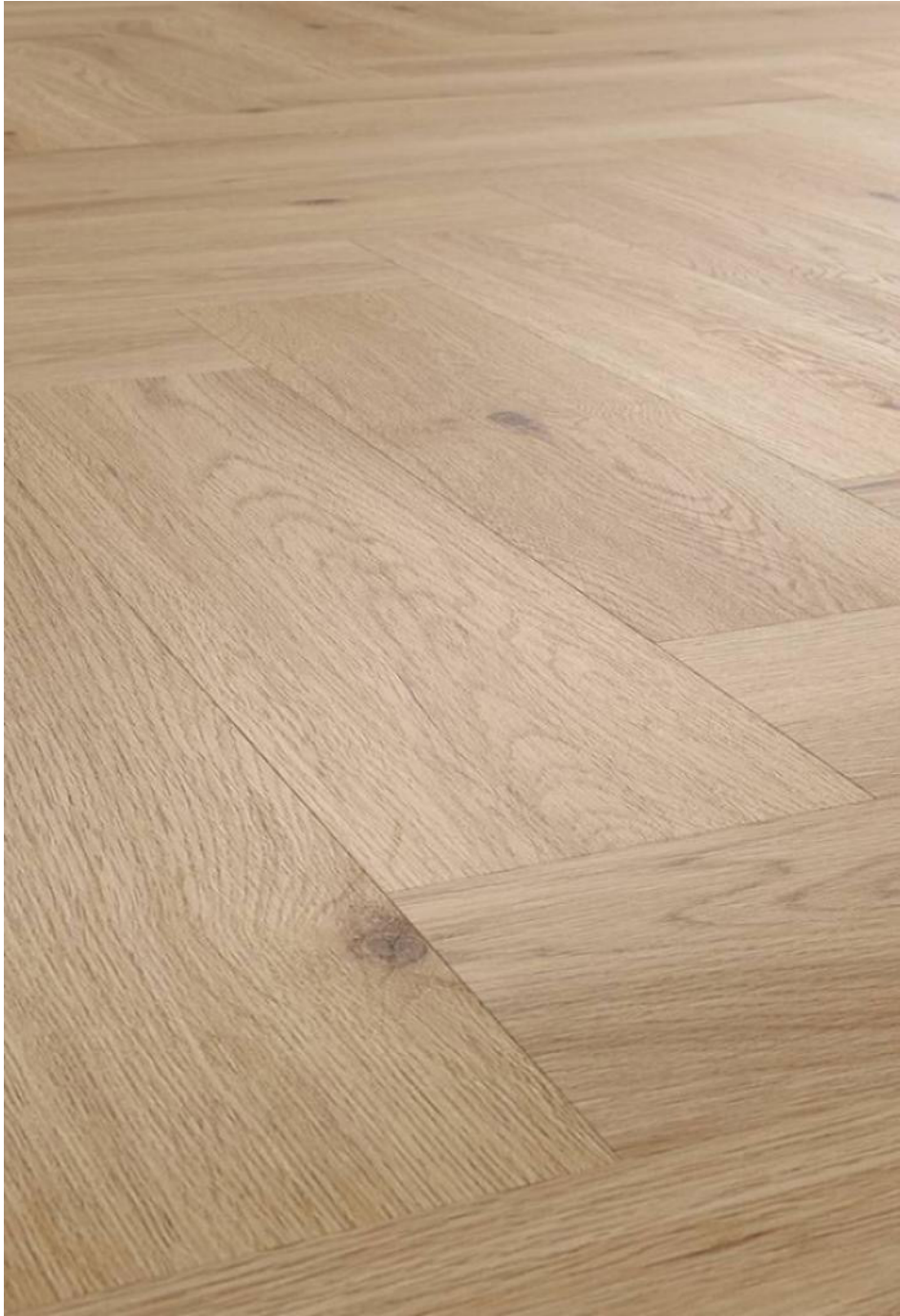
Floor: EVDC 5552 Herringbone Matt