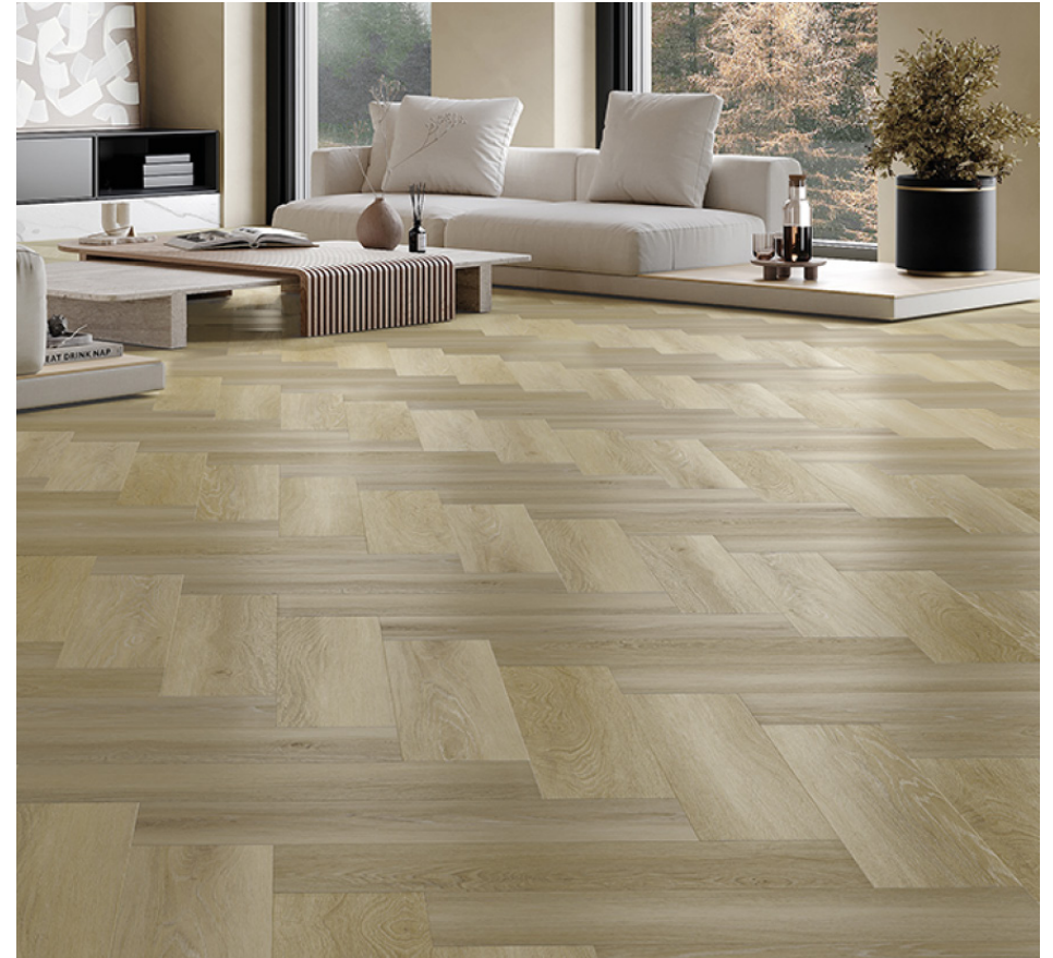
Floor: EVDC 5557 Herringbone Matt