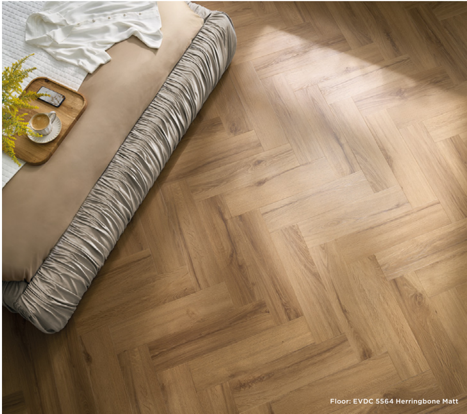
Floor: EVDC 5564 Herringbone Matt