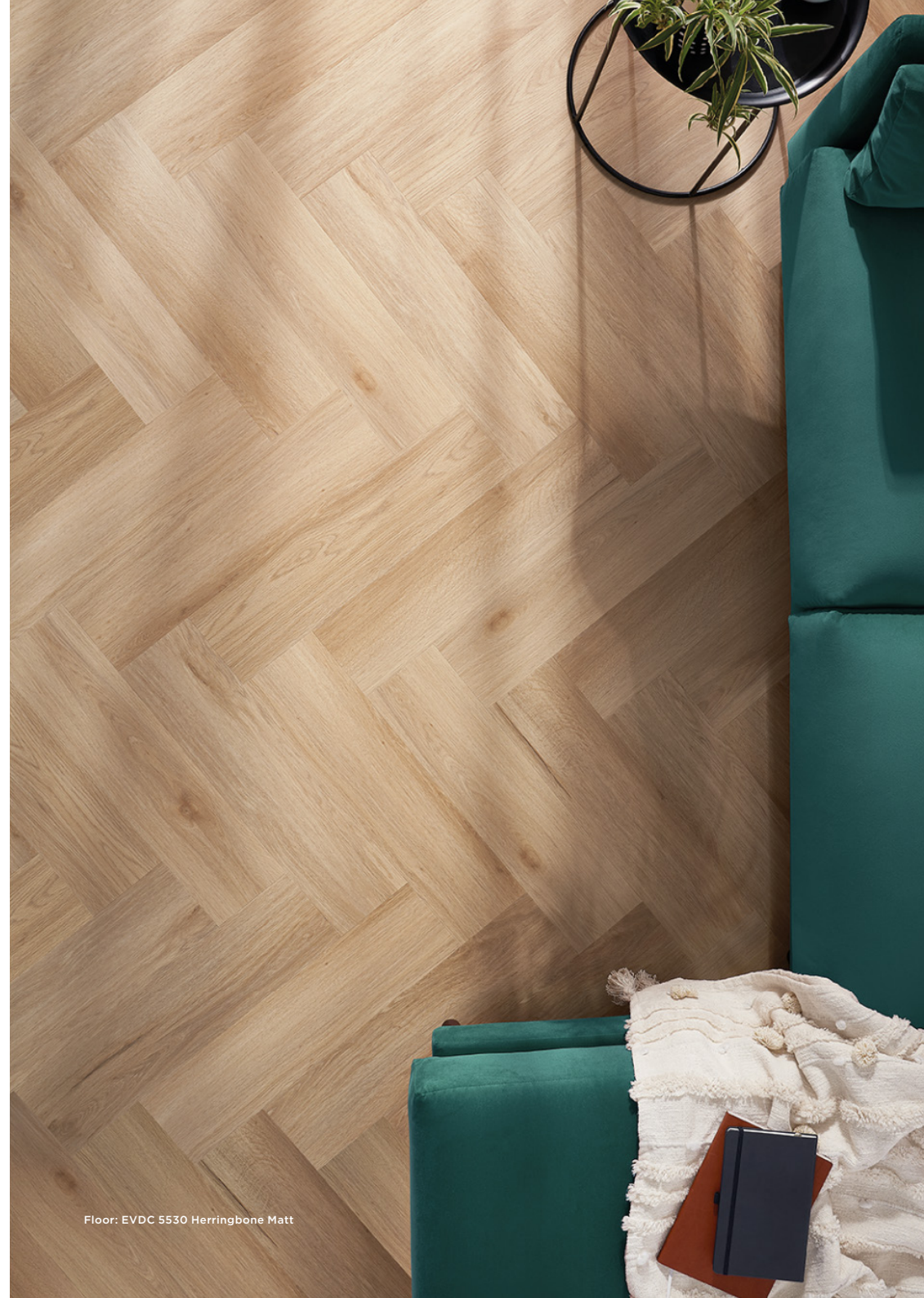
Floor: EVDC 5530 Herringbone Matt

Desca 55 Parquet offers a range of sustainable, dimensionally stable, and highly scratch-resistant engineered vinyl flooring. Available in eight wood-look shades, spanning natural and warm tones, it seamlessly coordinates with complementary colours from the Desca 55 XL and Desca 55 Chevron ranges.