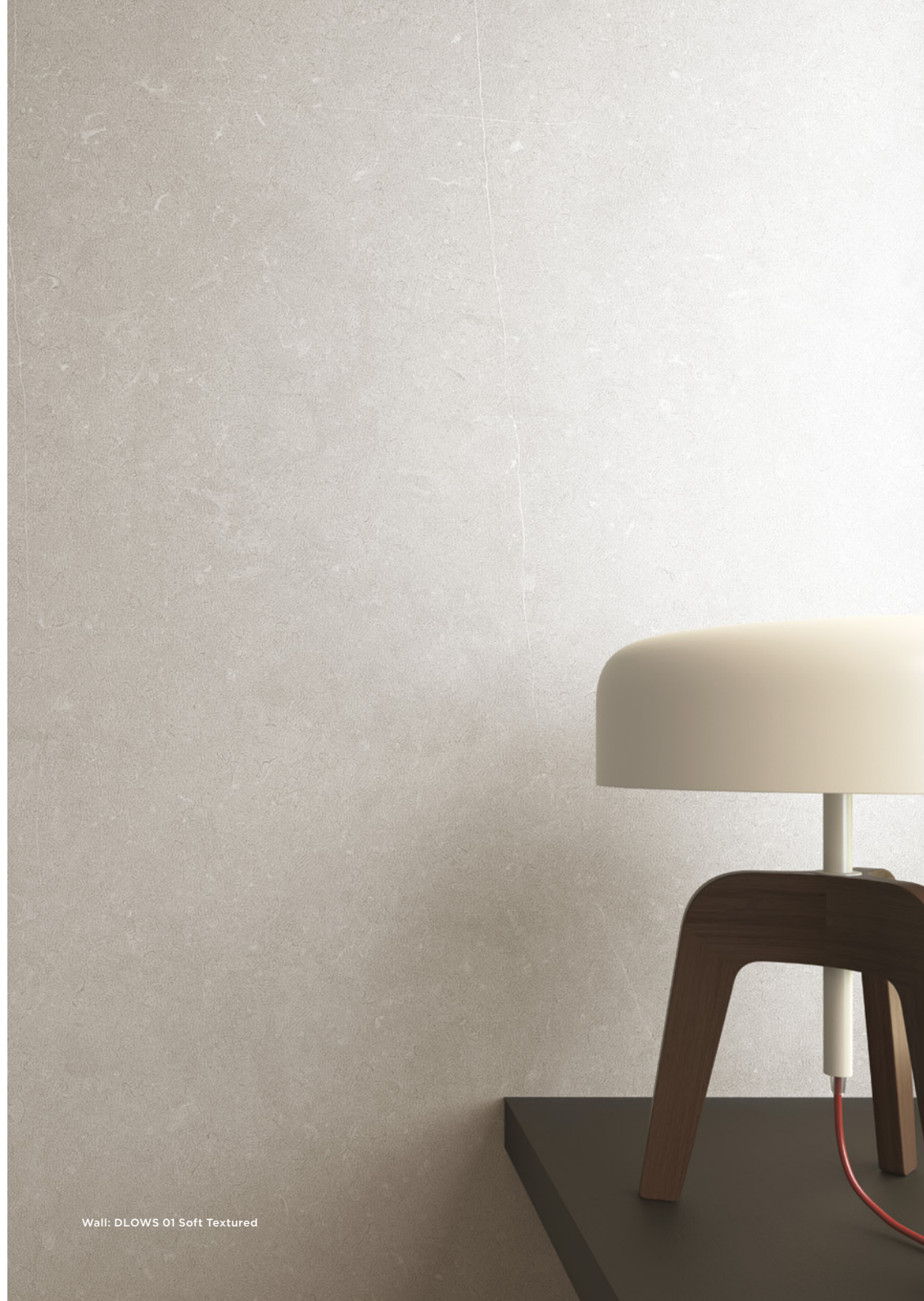
Wall: DLOWS 01 Soft Textured

Noon Wall Slim is a highly versatile lightweight ceramic slab range for walls that utilises the ground-breaking Ductile® technology. Thanks to its high adaptability and 6mm thickness, this material is ideal for interior cladding. It's easy to handle and fit. Refer to Noon for 9mm-thick porcelain alternatives.