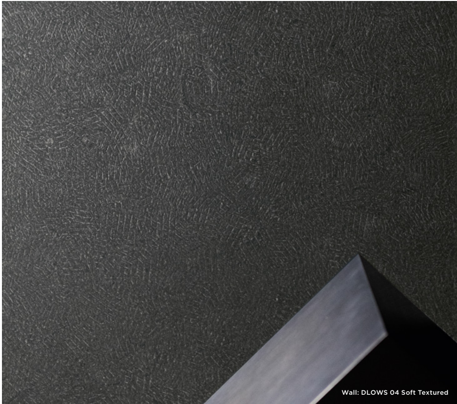
Wall: DLOWS 04 Soft Textured