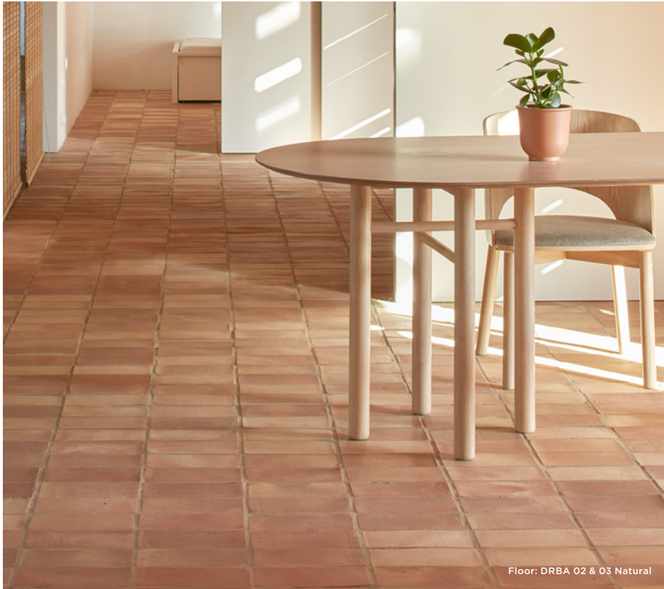
Floor: DRBA 02 & 03 Natural