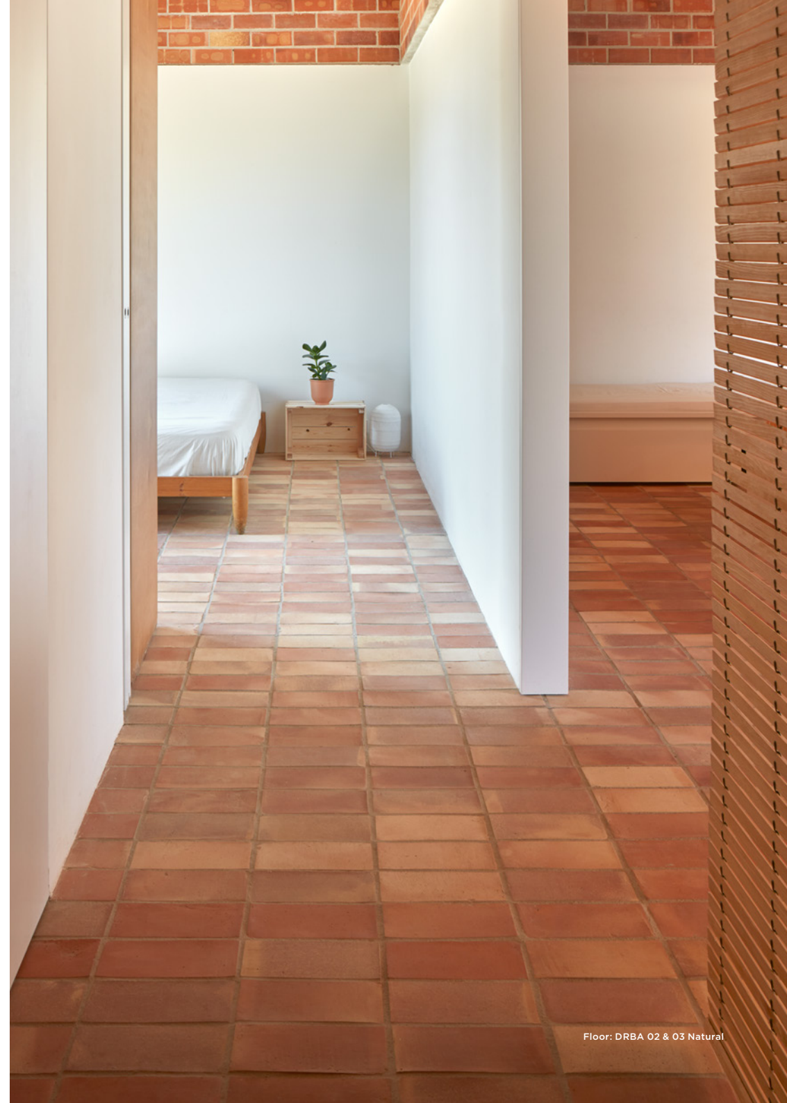
Floor: DRBA 02 & 03 Natural

Barcelo Raw is a range of terracotta tiles, handmade in Spain using traditional wood-fired, walk-in kilns. These charming tiles possess innate warmth and character, with hand-finished edges, creating a truly natural aesthetic.