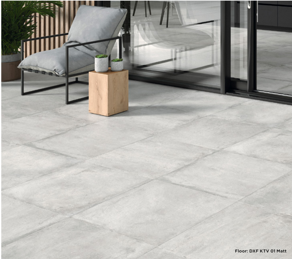
Floor: DXF KTV 01 Matt