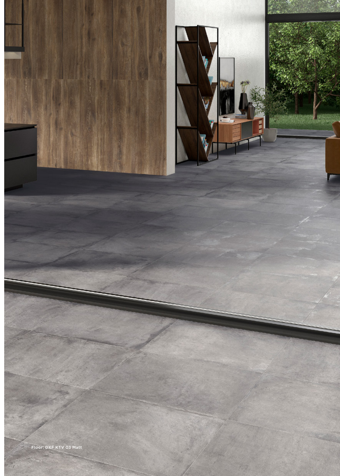
Floor: DXF KTV 03 Matt

Riviera 20mm is a range of concrete-effect porcelain tiles in grey tones. Subtle surface texture and high shade variation mimic the authentic look of concrete, whilst displaying an industrial modern aesthetic. With an anti-slip matt finish, this durable 20mm porcelain is perfectly suited for outdoor use.