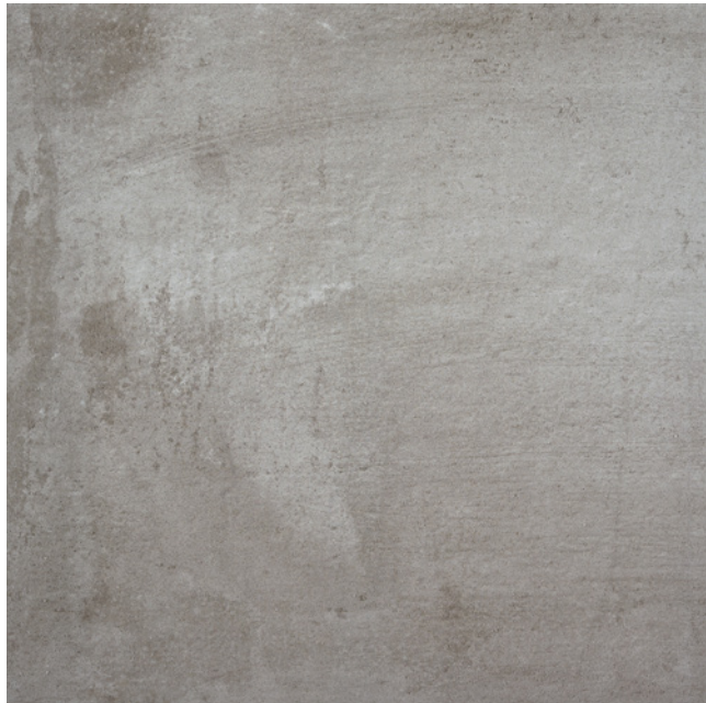
DXF KTV 03