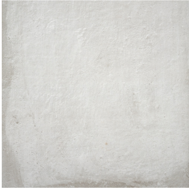
DXF KTV 01