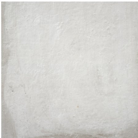
DXF KTV 01