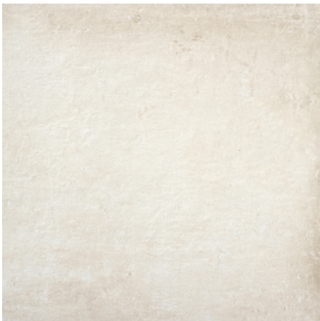
DXF KTV 02