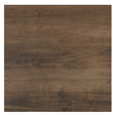
DXF MATH 04