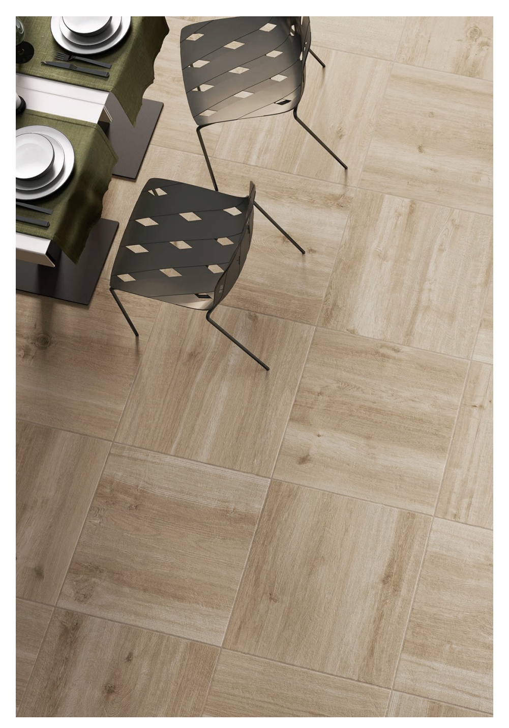
Floor: DXF MATH 02 Natural Anti-Slip