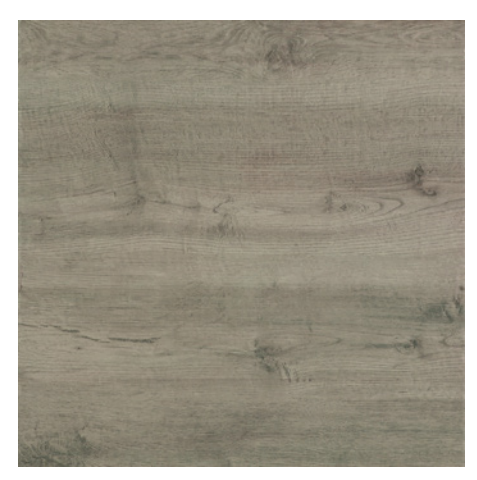
DXF MATH 08