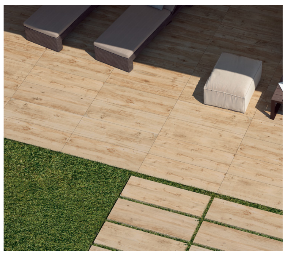
Floor: DXF MATH 05 Natural Anti-Slip