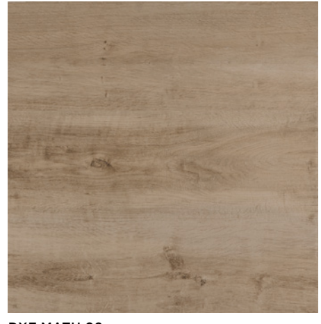
DXF MATH 02