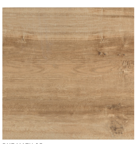
DXF MATH 05