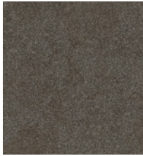
DCSNS 05 Sand