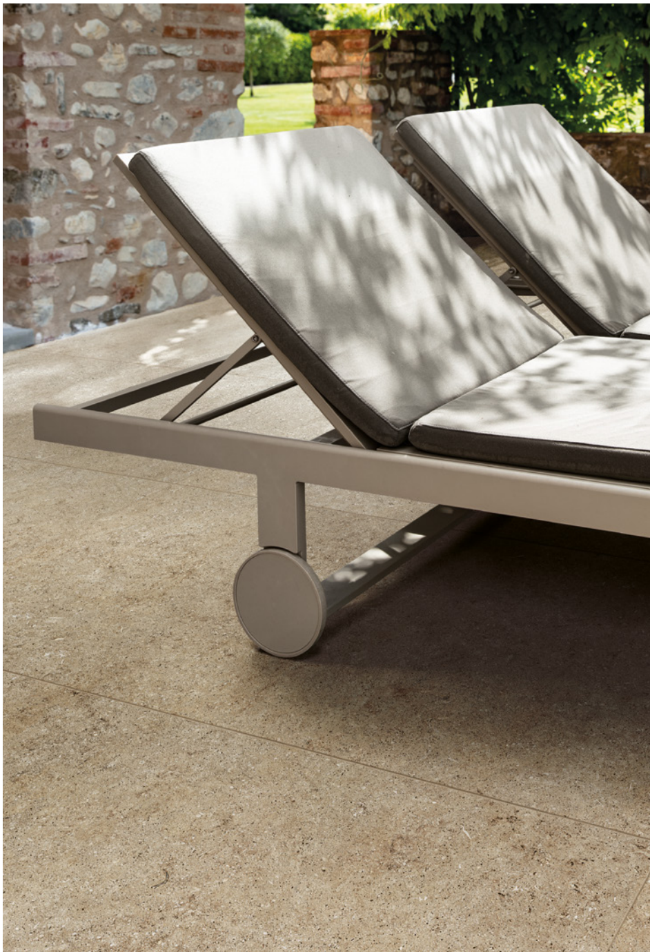
Floor: DCSNF 04 Fossil Natural Grip