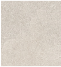
DCSNS 01 Sand