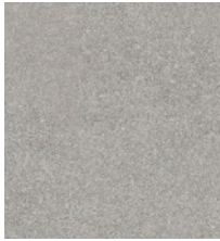
DCSNS 03 Sand