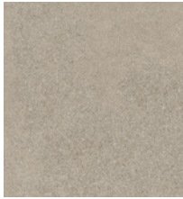
DCSNS 02 Sand