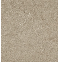
DCSNL 04 Lithos