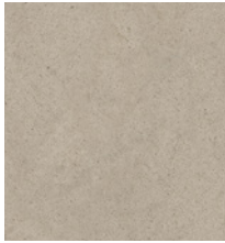
DCSND 02 Dust