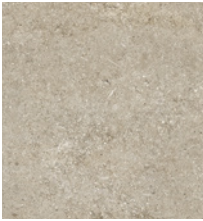
DCSNF 02 Fossil