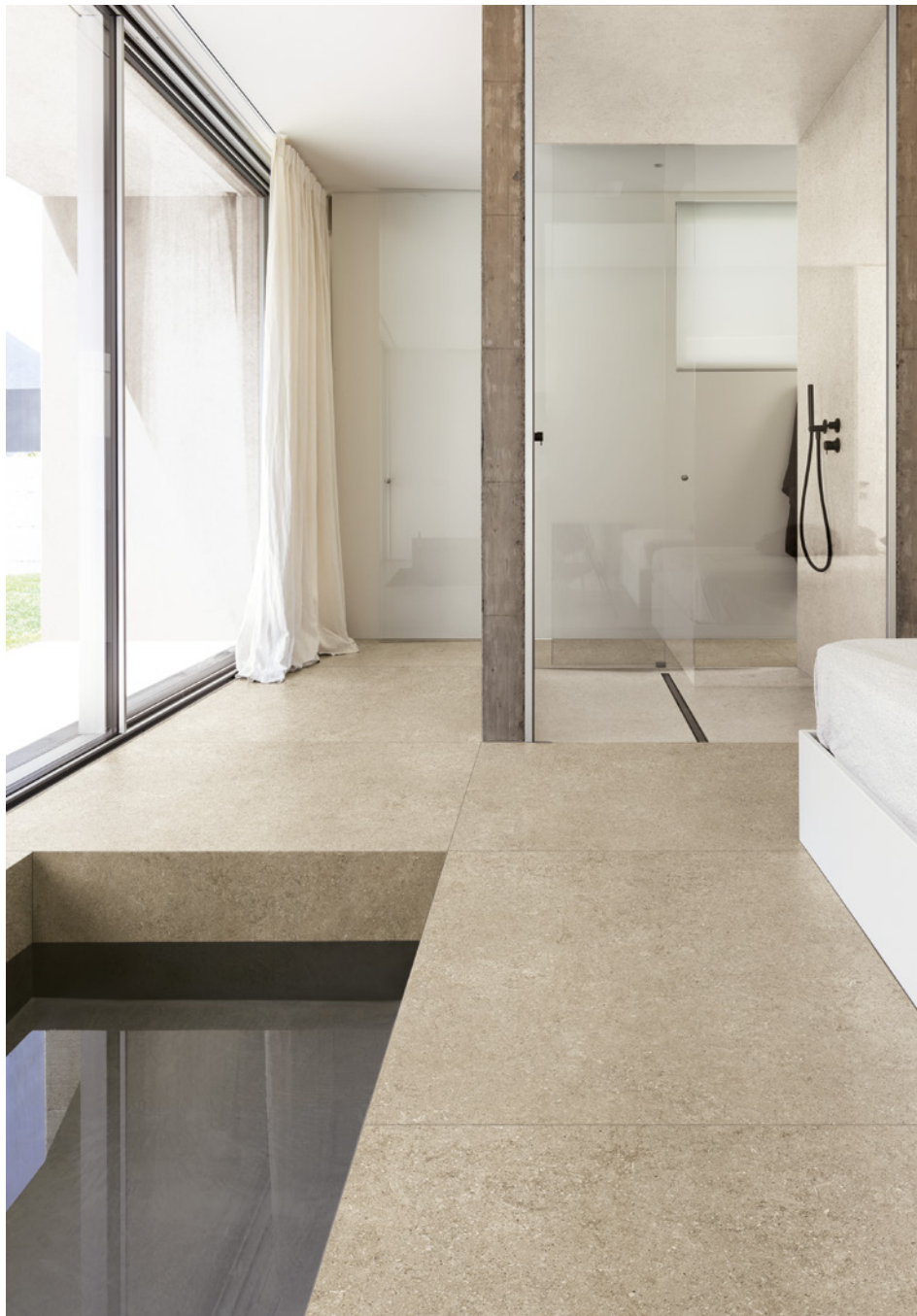
Floor: DCSNF 02 Fossil Natural Grip Shower Ceiling, Wall & Floor: DCSNF 01 Fossil Natural Grip