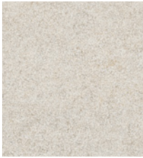
DCSNL 01 Lithos