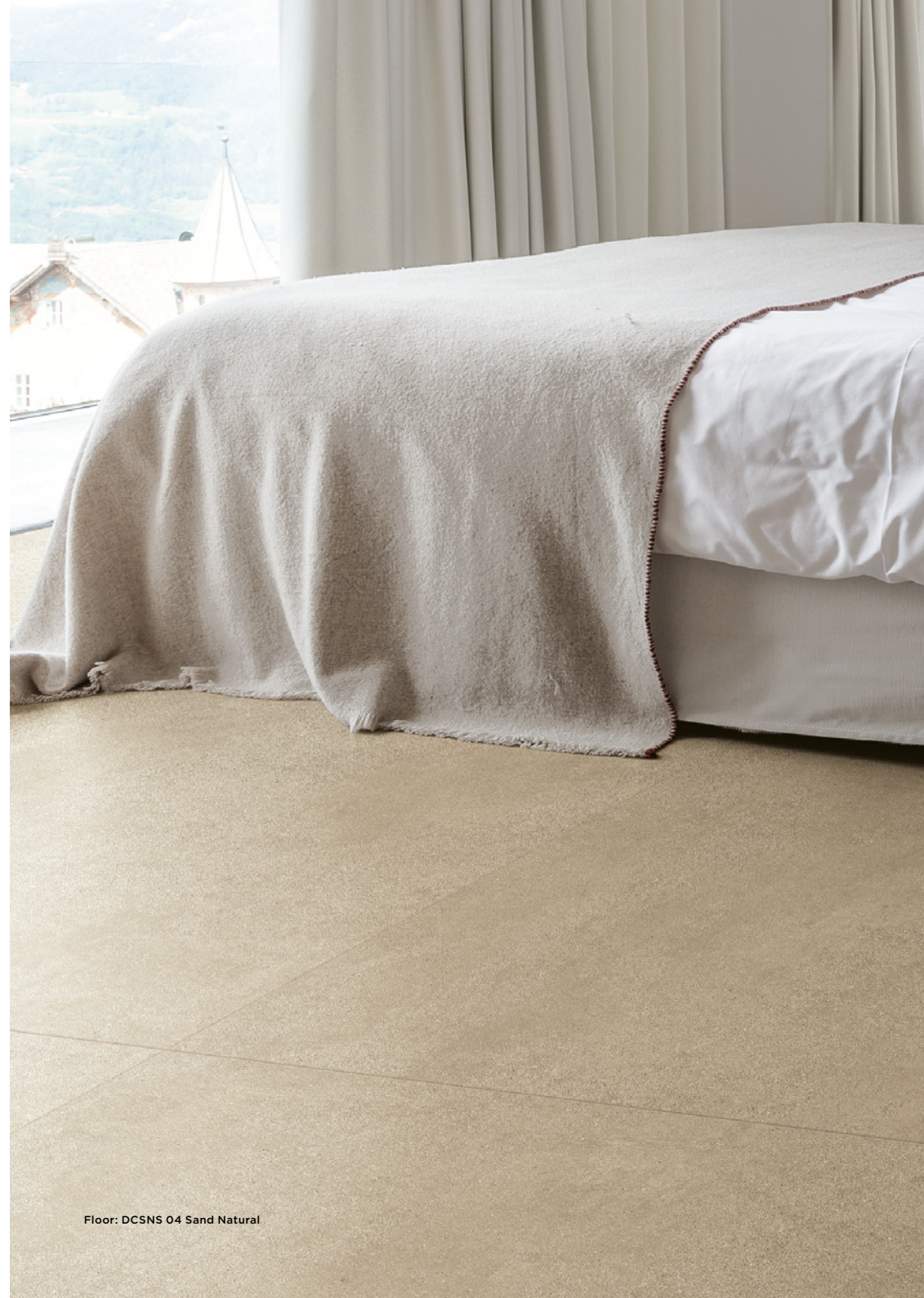
Floor: DCSNS 04 Sand Natural

In a neutral palette of mineral tones with surface textures inspired by earth, sand & stone, Sensi takes its cues from nature to introduce a sense of character to interior & exterior spaces. Made from 20.5% recycled materials mixed with natural raw materials through a sustainable production process.