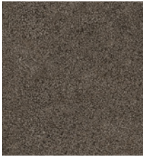
DCSNL 05 Lithos