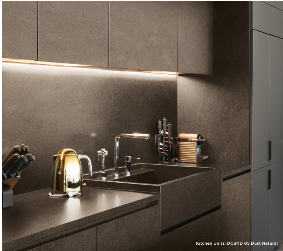
Kitchen Units: DCSND 05 Dust Natural

5 Colours / 2 Finishes / 4 Textures / 3 Sizes