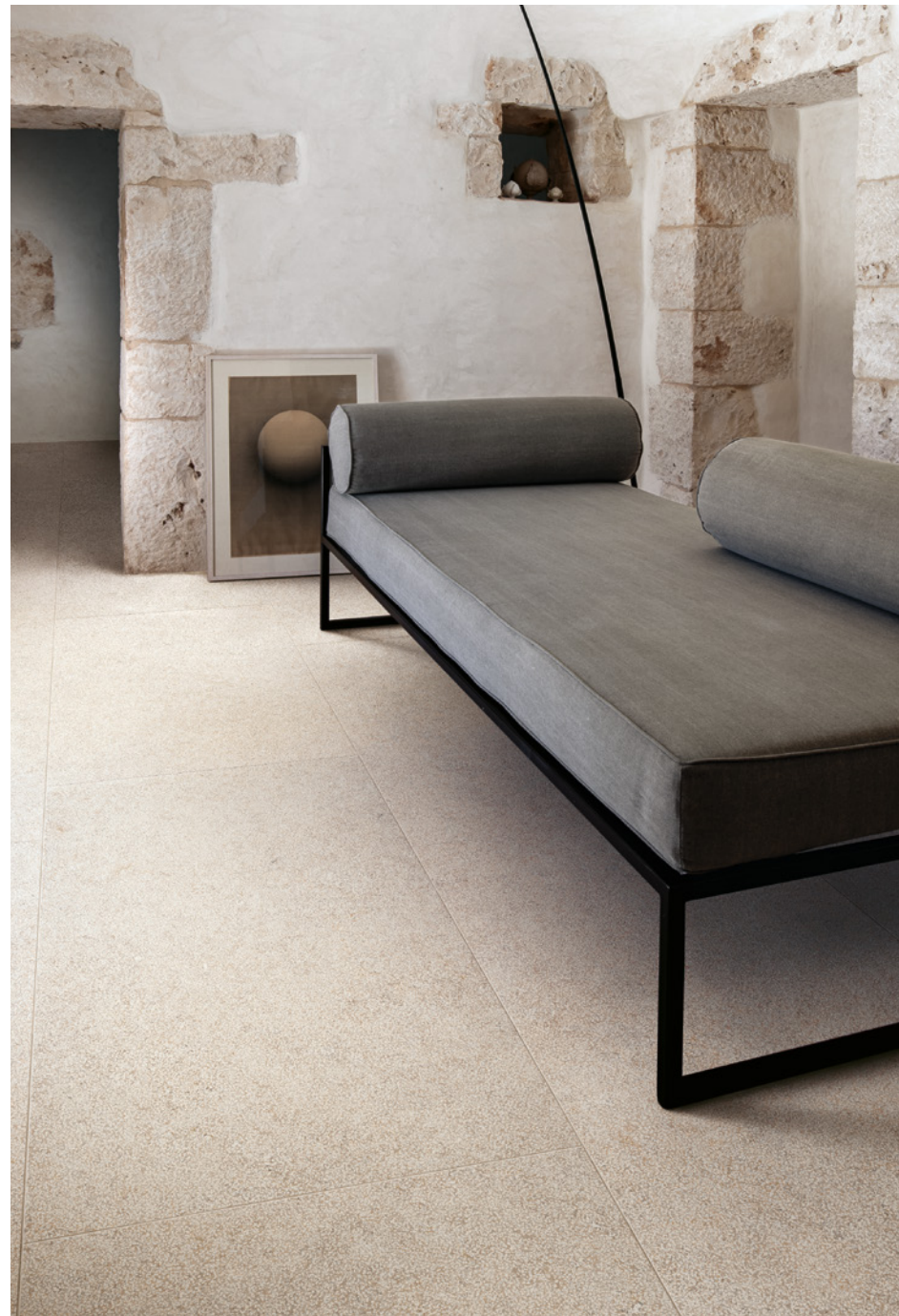
Floor: DCSNL 01 Lithos Natural