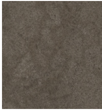
DCSND 05 Dust