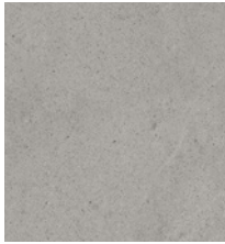
DCSND 03 Dust