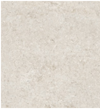
DCSNF 01 Fossil