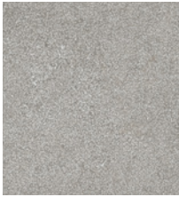
DCSNL 03 Lithos