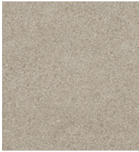
DCSNL 02 Lithos