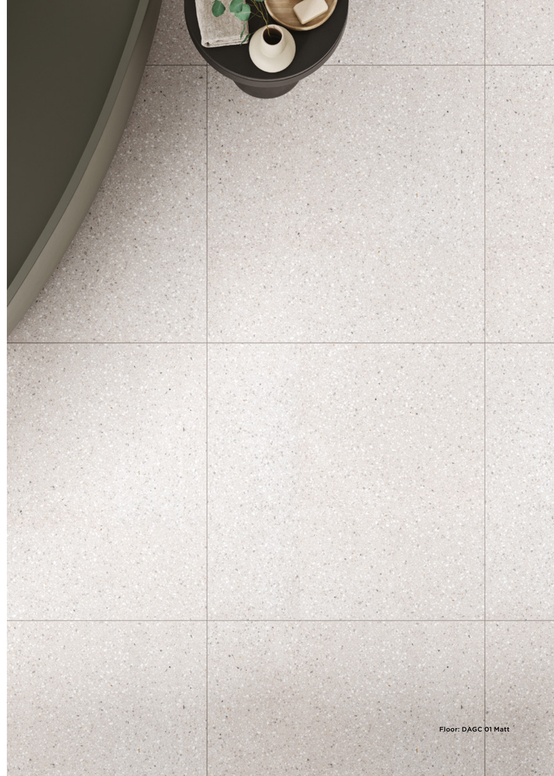
Floor: DAGC 01 Matt

Arcade is a traditional and carefully-crafted terrazzo-effect porcelain tile range with subtle shiny effects that add realism to spaces. These rectified porcelain tiles with the Lettère Décor option provide differentiation and style within the same range.