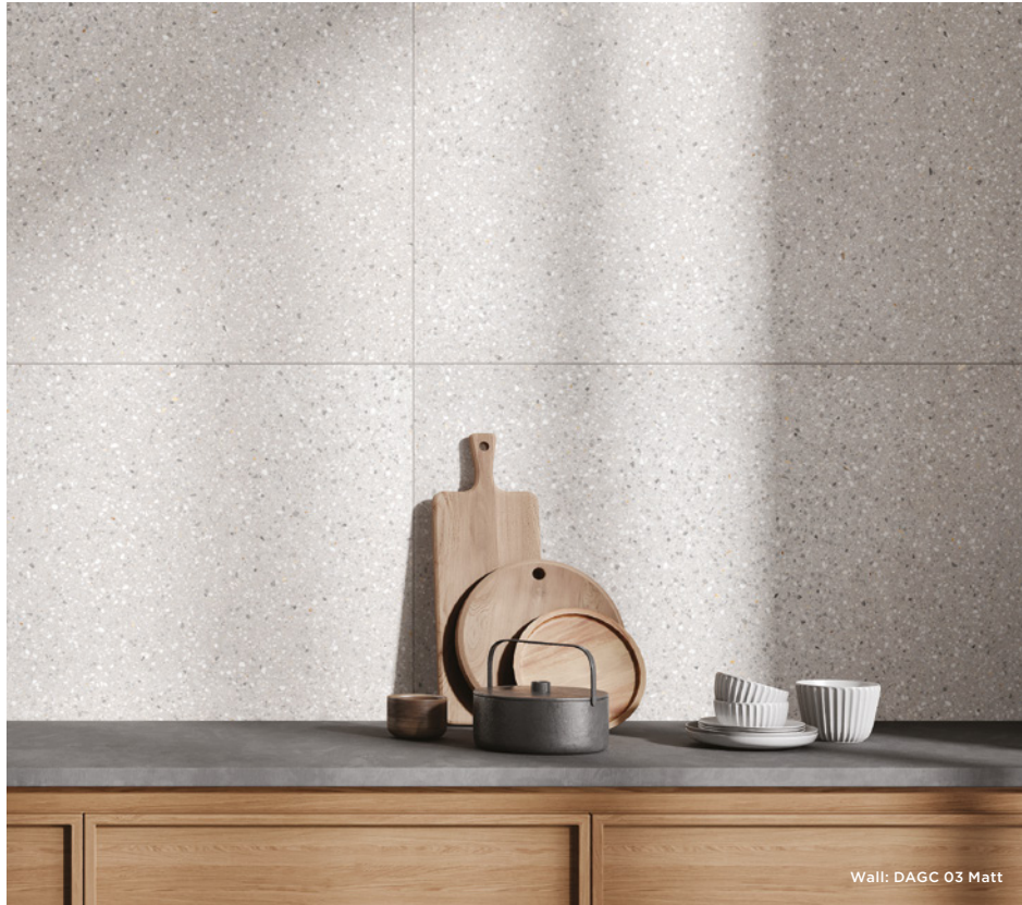
Wall: DAGC 03 Matt

3 Colours / 1 Finish / 4 Sizes / 1 Décor