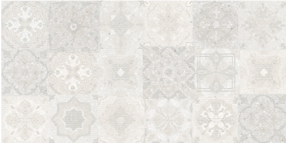
DAGC Lettere Décor