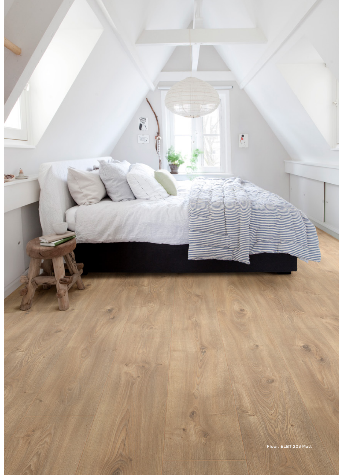
Floor: ELBT 203 Matt

Boutique Manor offers engineered laminate planks of exceptional quality, distinguished by their generous width and highly realistic surface structure. A subtle four-sided bevel adds to the refined aesthetic, while the integrated Uniclic™ click system ensures effortless installation.