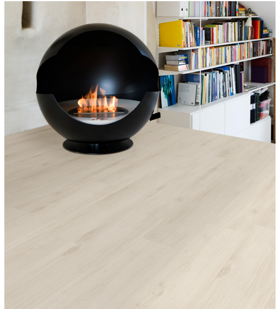
Floor: ELBT 201 Matt