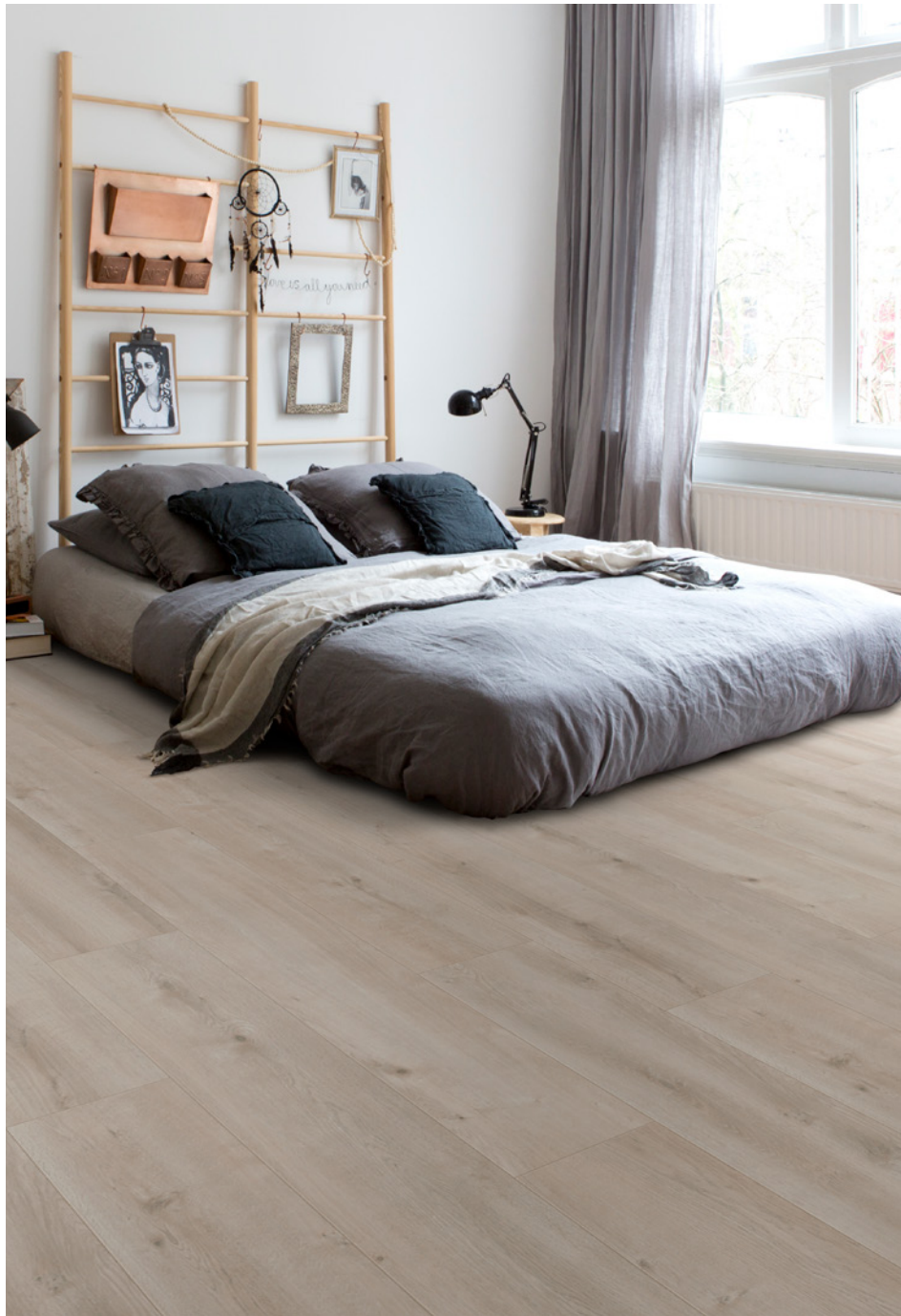
Floor: ELBT 208 Matt