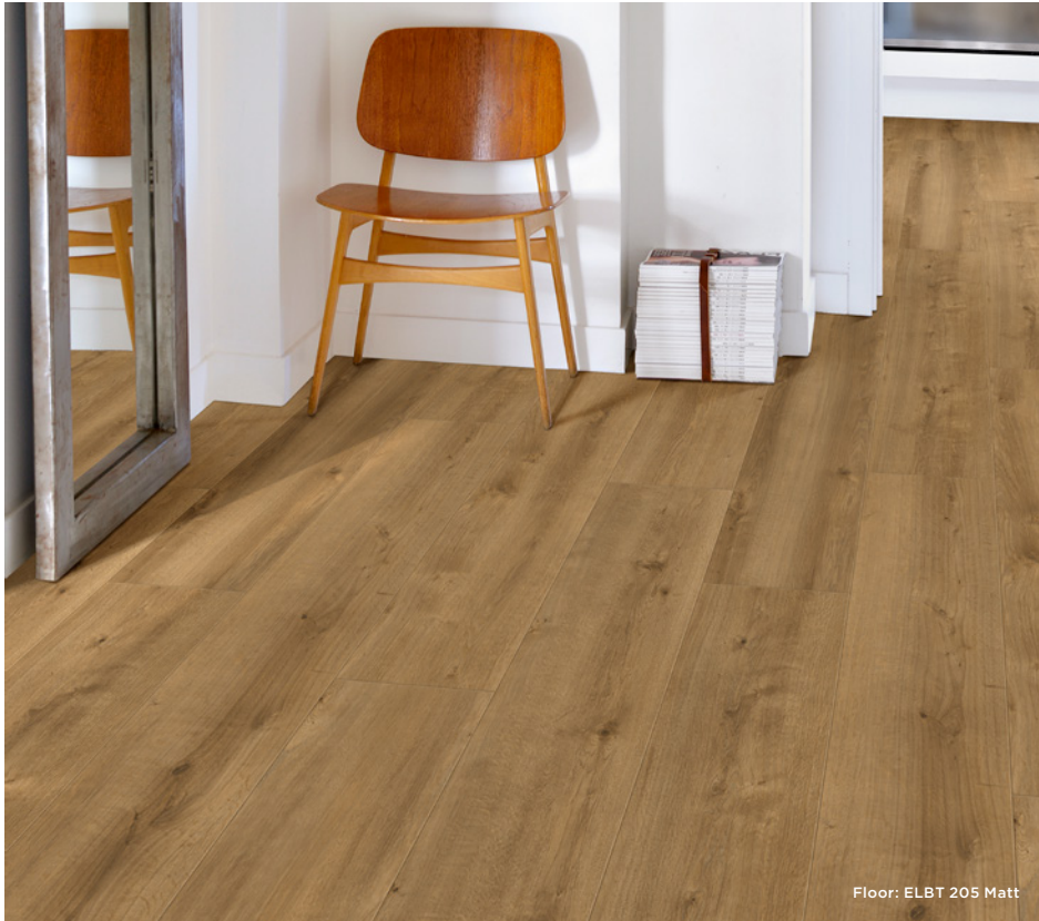
Floor: ELBT 205 Matt