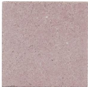
DSRG 02 Consolare