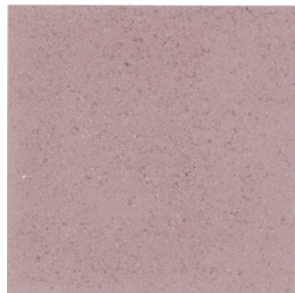
DSRG 02 Compact