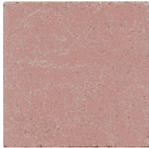
DSRG 03 Consolare