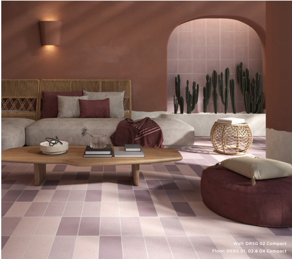
Wall: DRSG 02 Compact Floor: DSRG 01, 02 & 04 Compact