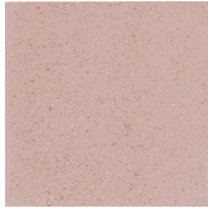
DSRG 01 Compact