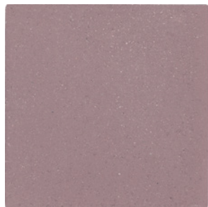
DSRG 04 Compact