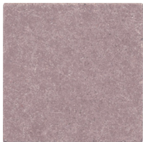
DSRG 04 Consolare