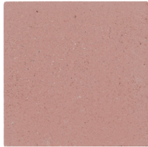
DSRG 03 Compact