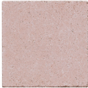
DSRG 01 Consolare