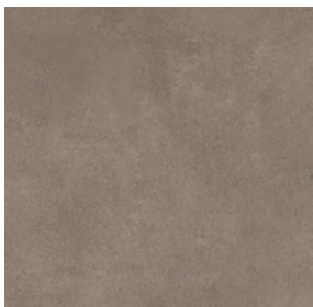
DXFMC 05 Cure