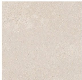
DXFMT 01 Cast