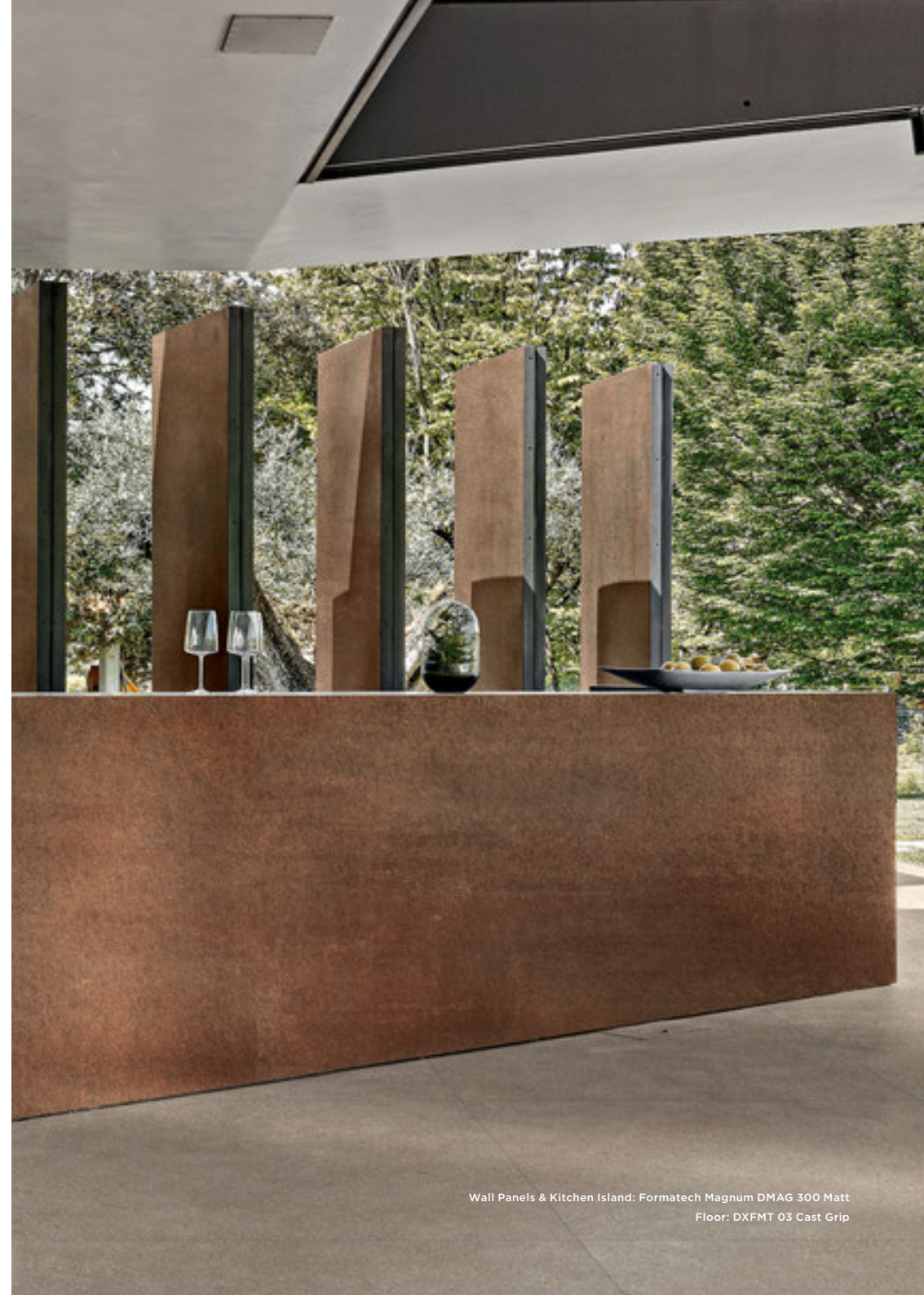
Wall Panels & Kitchen Island: Formatech Magnum DMAG 300 Matt Floor: DXFMT 03 Cast Grip