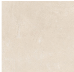
DXFMC 01 Cure