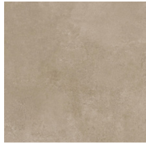
DXFMC 03 Cure