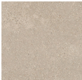
DXFMT 02 Cast