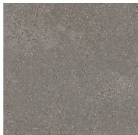
DXFMT 05 cast