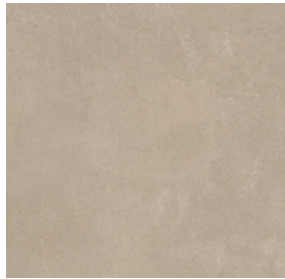
DXFMC 02 Cure