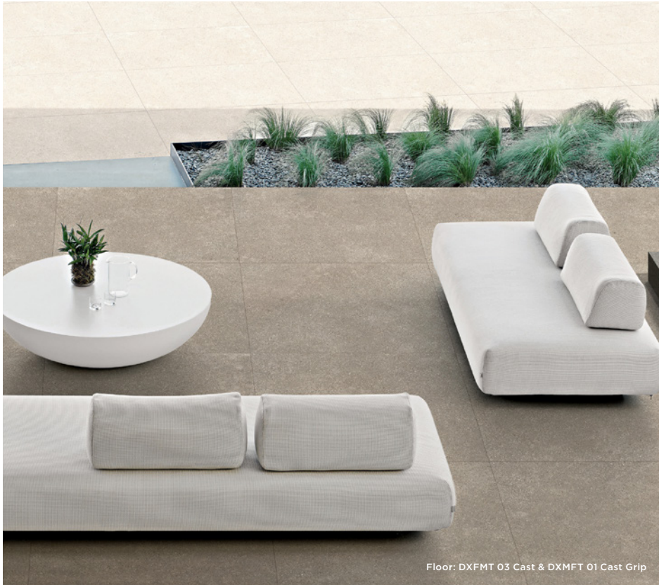
Floor: DXFMT 03 Cast & DXMFT 01 Cast Grip