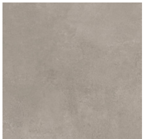
DXFMC 04 Cure