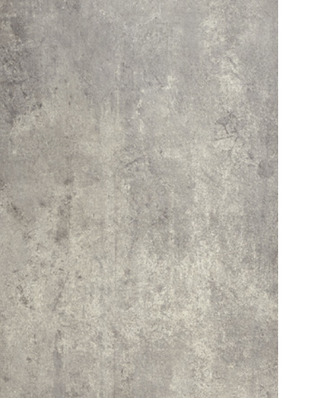
DXF DFRA 02