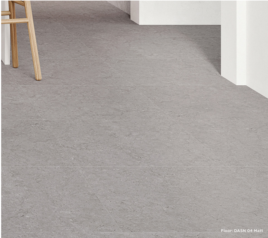
Floor: DASN 04 Matt