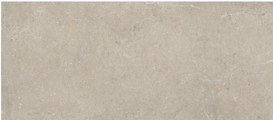
DXF MYLM 03