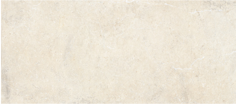
DXF MYLM 01