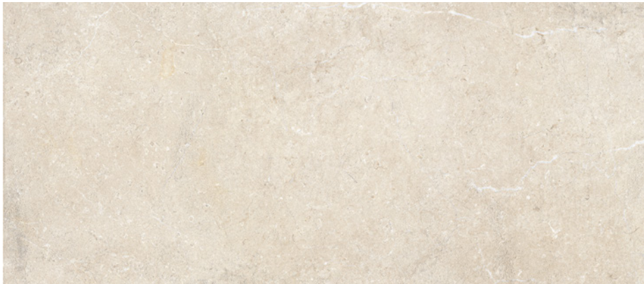
DXF MYLM 02