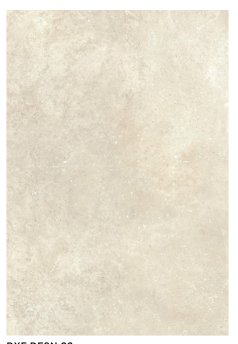
DXF DFSN 02