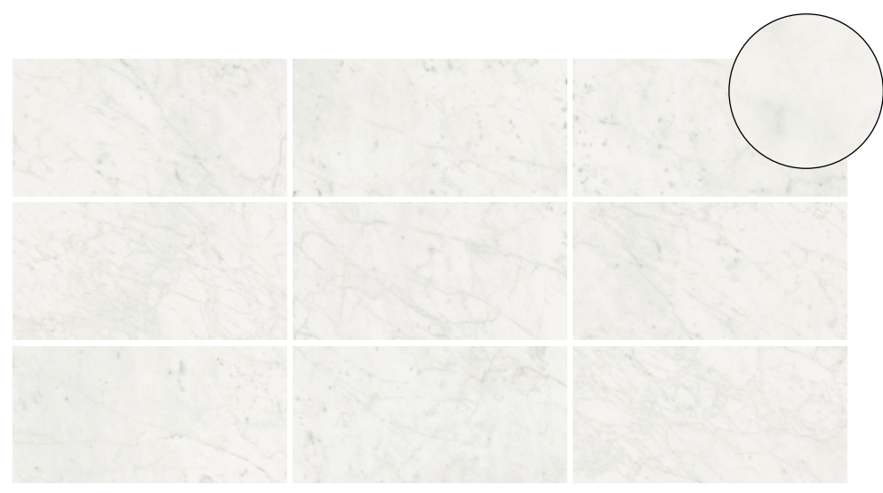
DXF DFSN 01