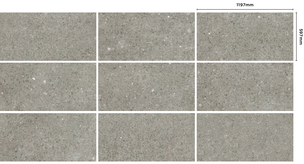
DXF DFSN 04