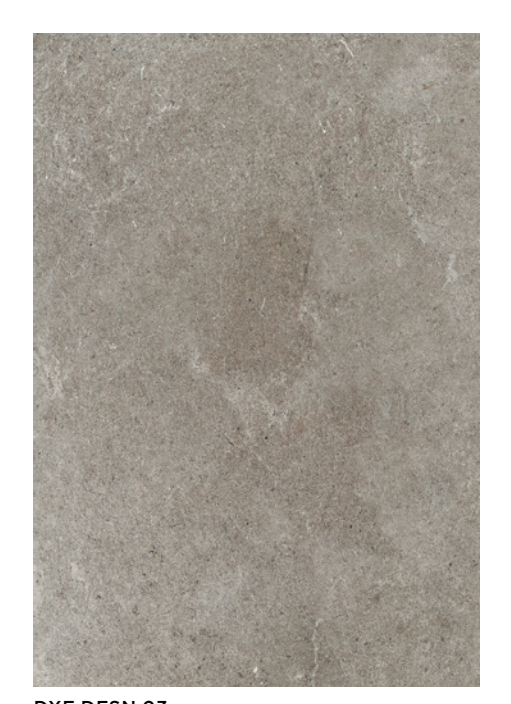
DXF DFSN 03