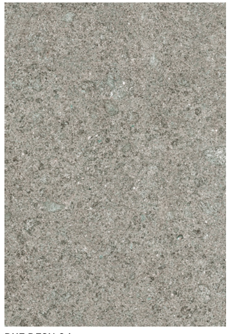
DXF DFSN 04