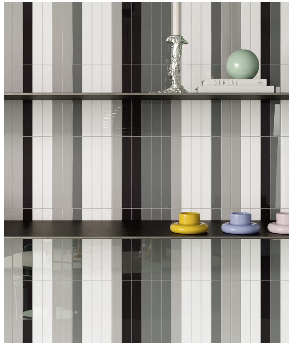
Wall: DQFC 01, 02, 03, 04, 17, 18 & 22 Gloss