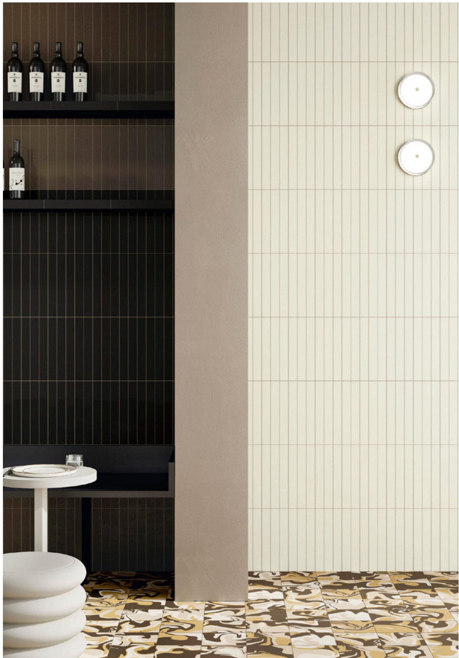
Walls: DQFC 04, 05 & 08 Gloss