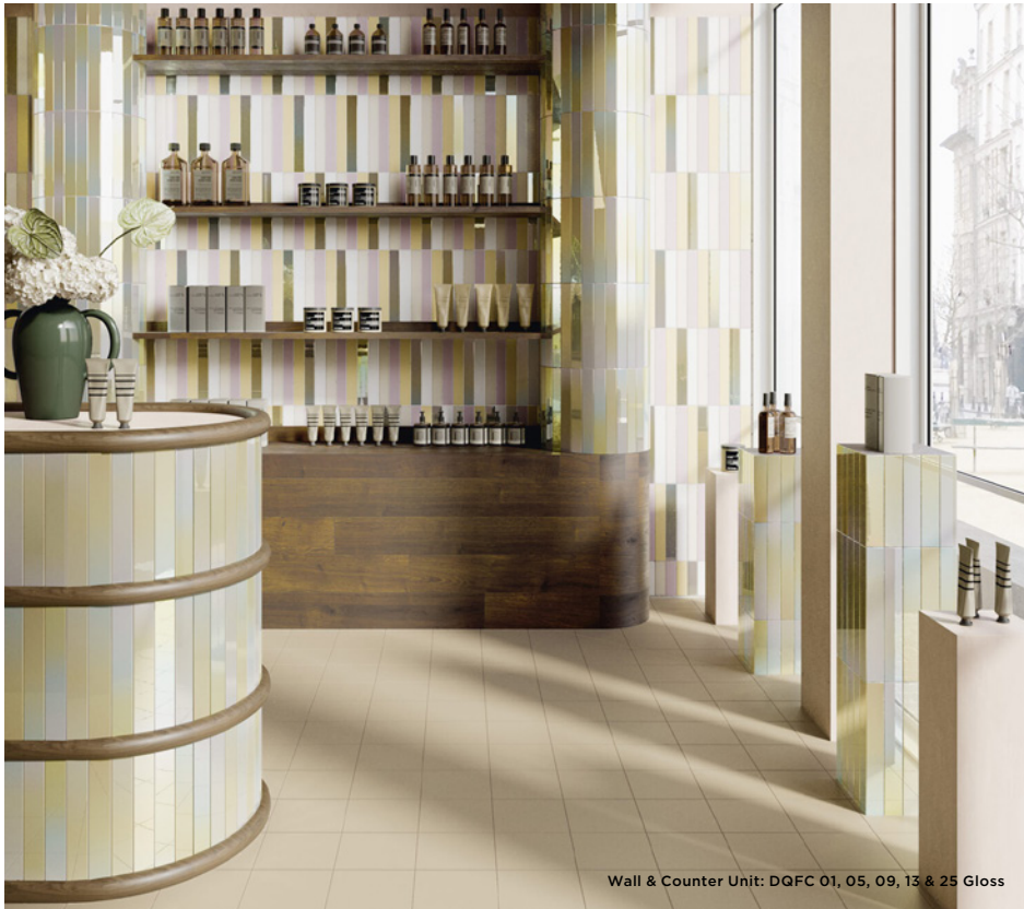
Wall & Counter Unit: DQFC 01, 05, 09, 13 & 25 Gloss