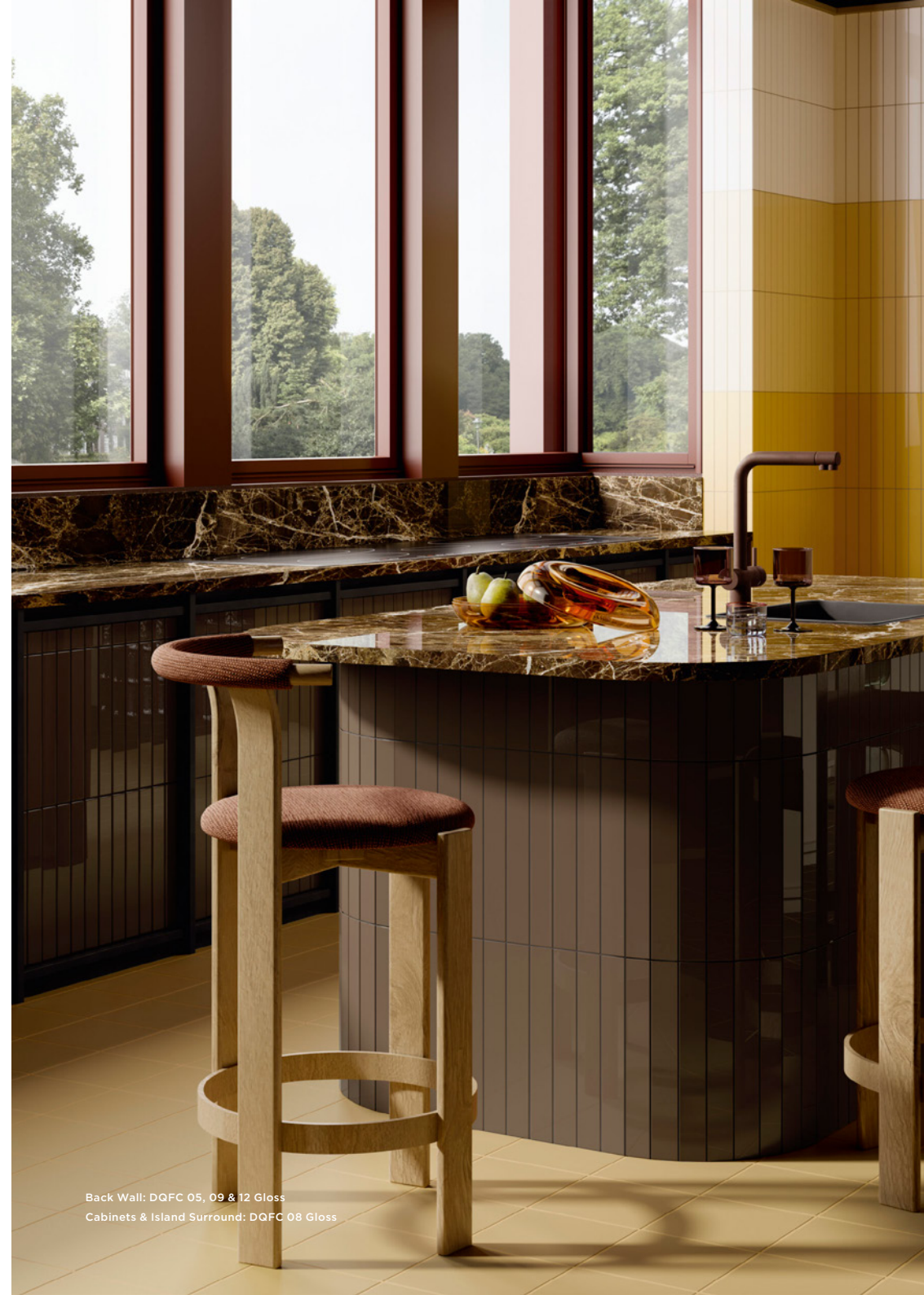
Back Wall: DQFC 05, 09 & 12 Gloss Cabinets & Island Surround: DQFC 08 Gloss

Colours introduces movement to interior spaces through flowing strip tiles inspired by paint in motion. The 4 × 33.4cm white-body ceramic tiles are available across six tonal families, offering flexibility for subtle tone-on-tone schemes or bold mixed layouts. The range includes 26 articles, including two iridescent colours.