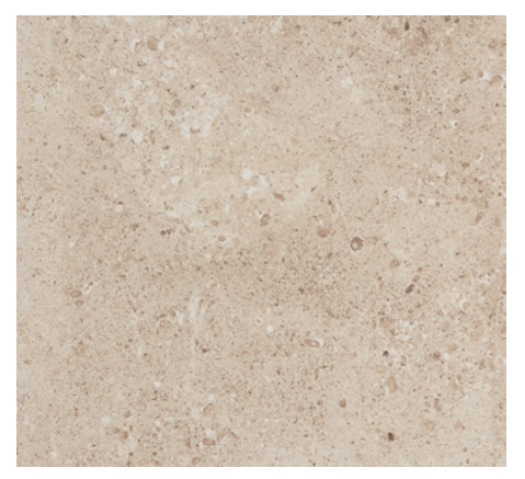
DXF MAGF 03