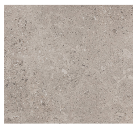
DXF MAGF 05