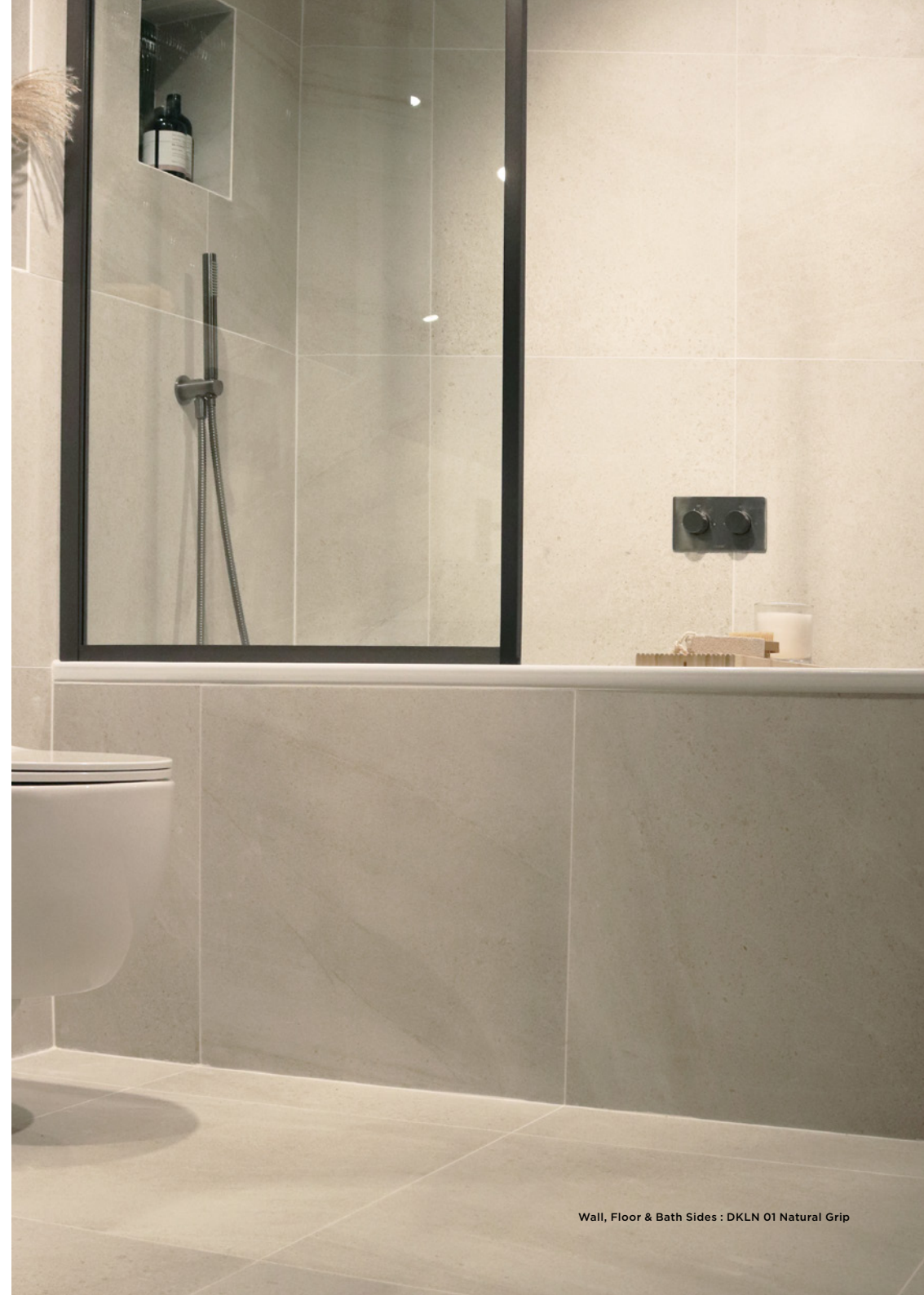
Wall, Floor & Bath Sides : DKLN 01 Natural Grip

Land 2.0 is a contemporary porcelain range with an exceptional level of detail and tonal variation. Suitable for wall and floor applications in budget-conscious projects. This range is easy to clean and maintain, and designed to provide high levels of slip performance in wet and dry areas.