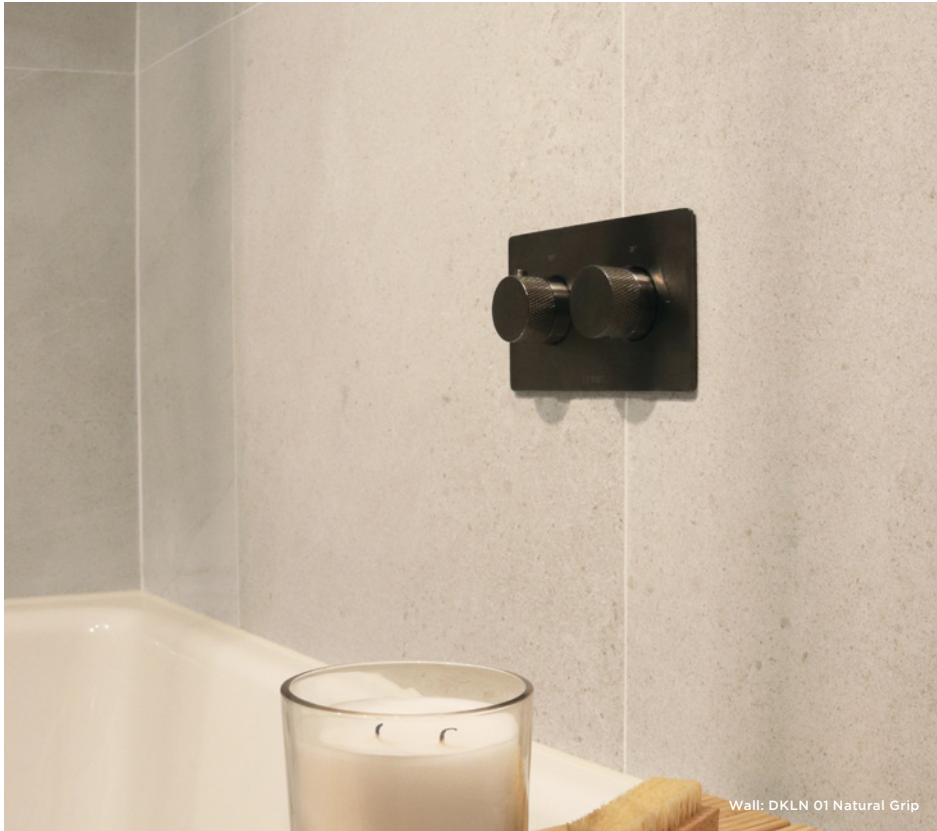
Wall: DKLN 01 Natural Grip