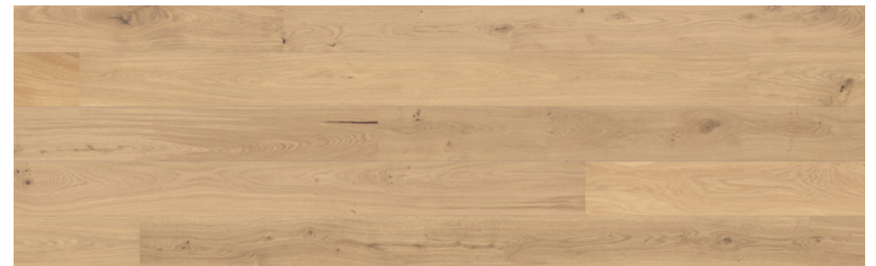
WDRO 884 Extra Matt UV Lacquer