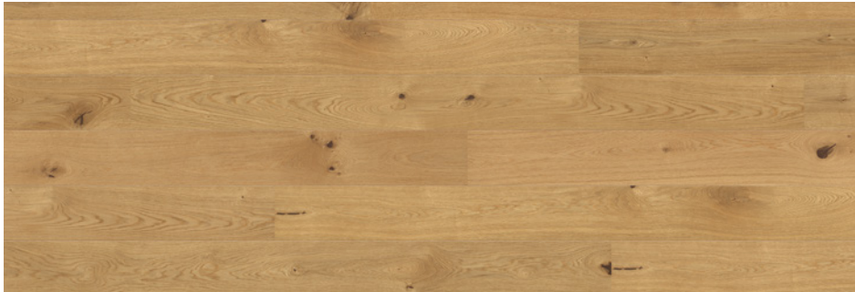
WDRO 885 Extra Matt UV Lacquer