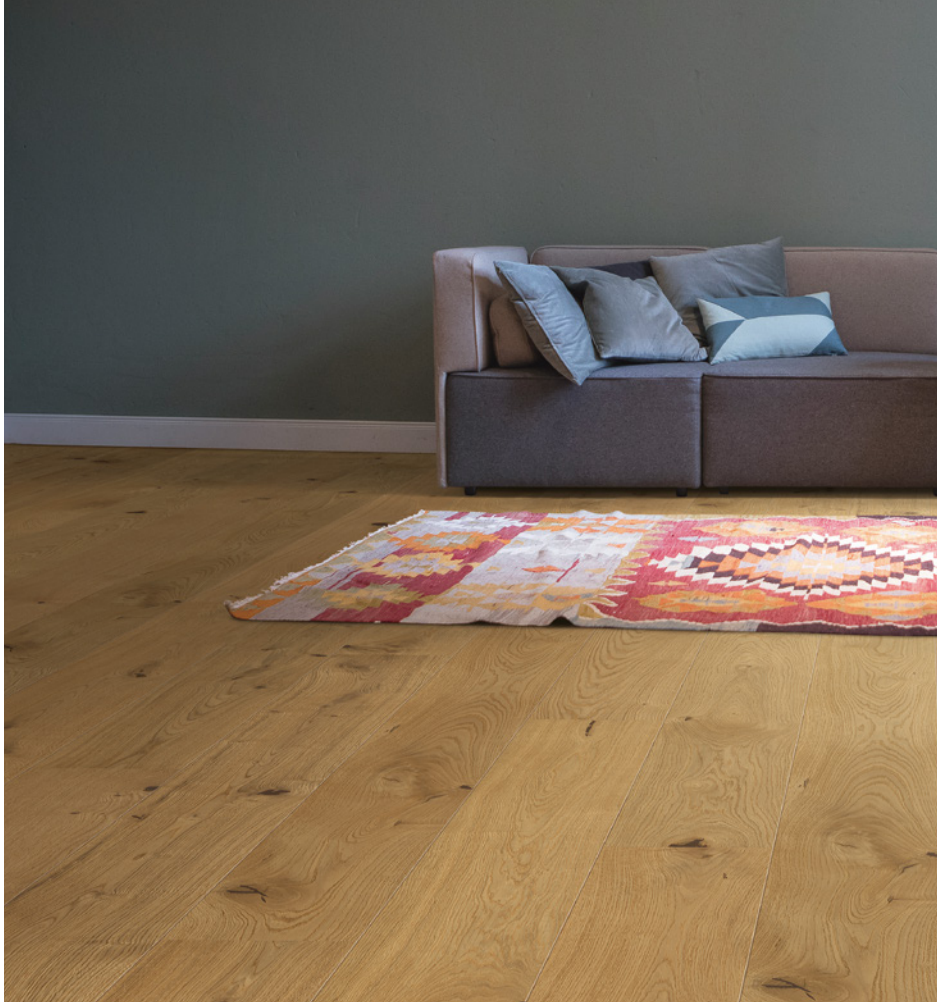
Floor: WDRO 885 Extra Matt UV Lacquer