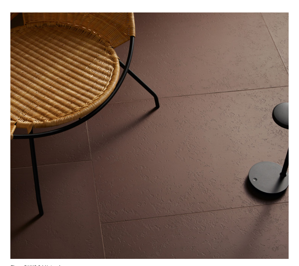
Floor: DMKS 04 Natural