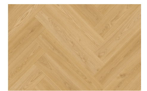
EVPE 705 Herringbone