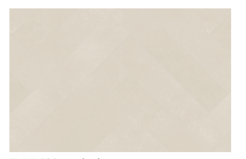
EVPE 702 Herringbone