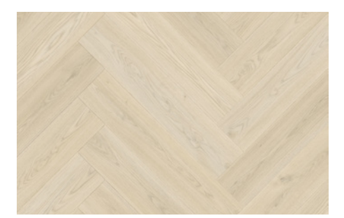
EVPE 706 Herringbone