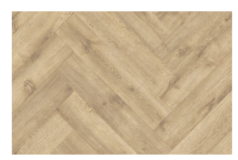
EVPE 707 Herringbone