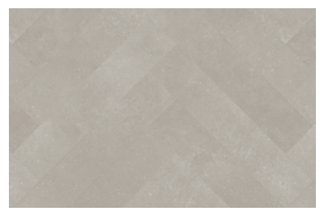
EVPE 701 Herringbone