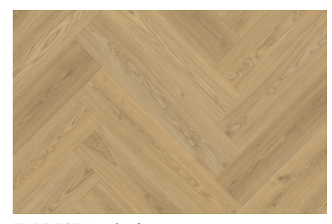
EVPE 703 Herringbone