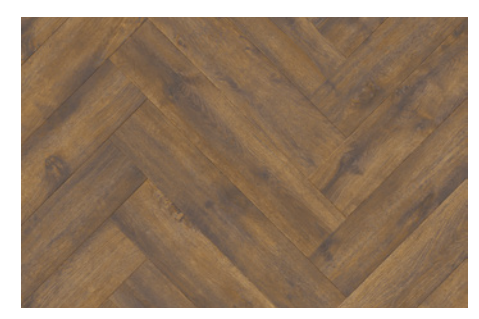
EVPE 708 Herringbone