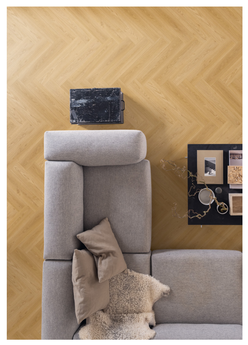
Floor: EVPE 706 Herringbone Matt