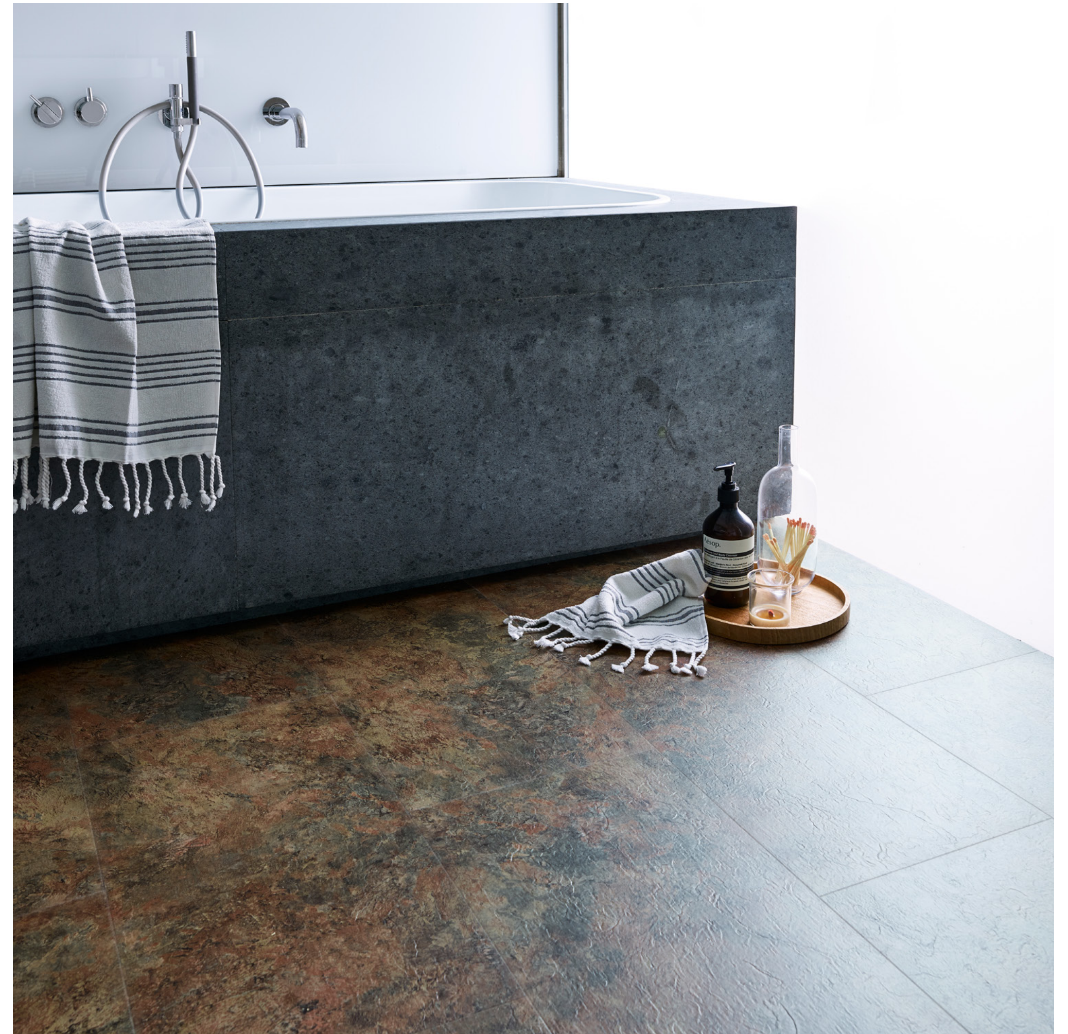
Left: LX Hausys Decotile 55 DLG 1265-55

LVT surfaces do not hold dust, dirt, pollen or other allergens.