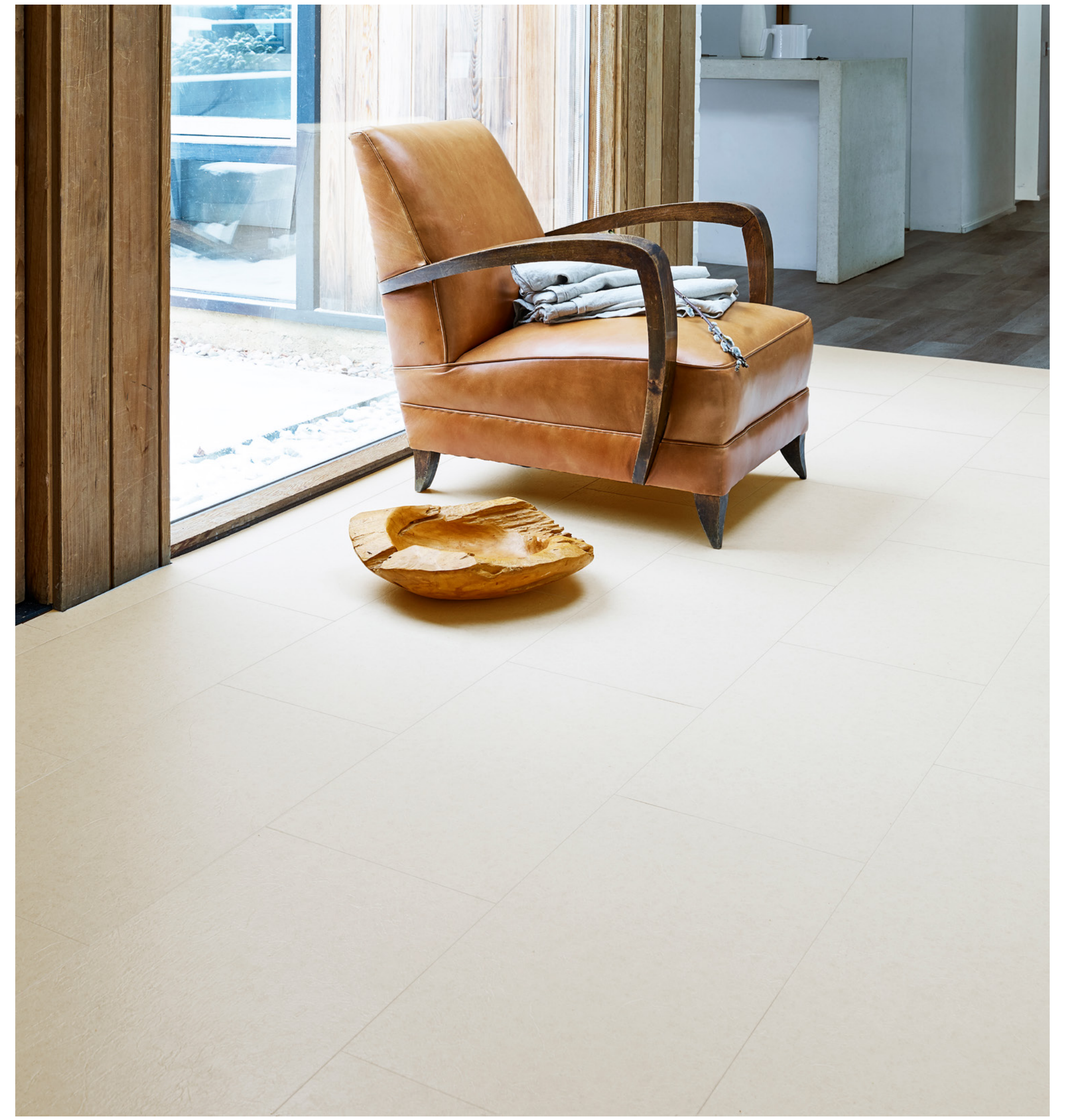
Left: LX Hausys Decoclick DLG 1251-C Above: LX Hausys Decoclick DLG 1701-C

The exclusive double-coated PUR surface treatment protects your floor, reducing the need for specialist products and equipment.