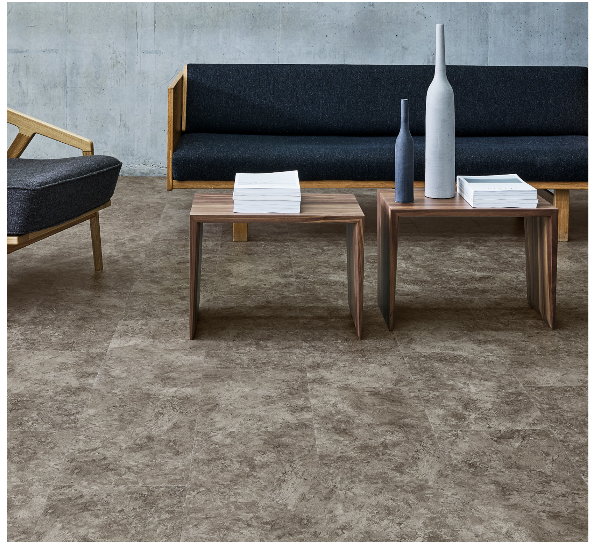
Left: LX Hausys Decotile 55 DLG 1251-55 Above: LX Hausys Decotile 55 DLG 1702-55

Warmer and quieter than its natural counterpart. Suitable for underfloor heating.